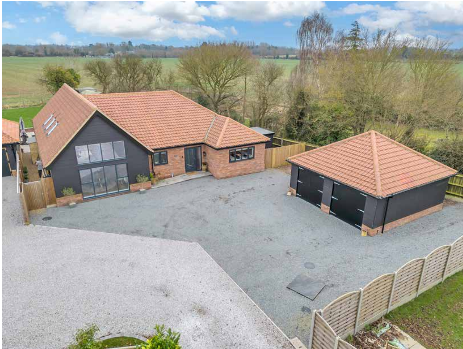
'Bespoke Modern Family Home' Cotton, Stowmarket, Suffolk | IP14 4ND