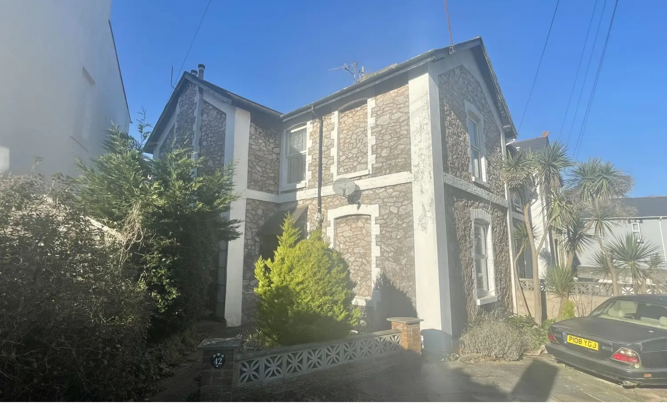
42 Upton Road, Torquay - TQ1 4AJ Guide Price £230,000