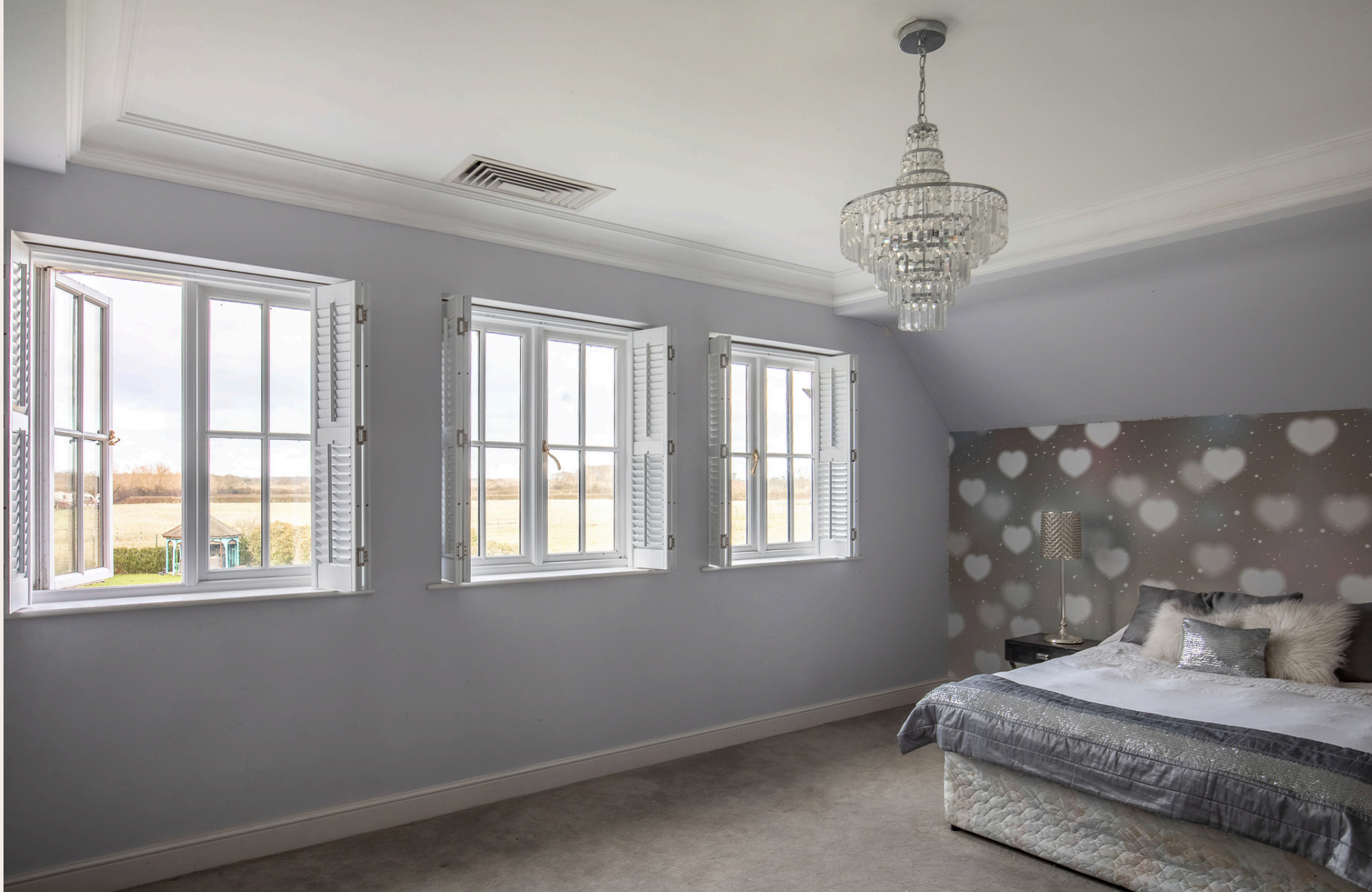
CHURCHFIELD LODGE, WINKFIELD