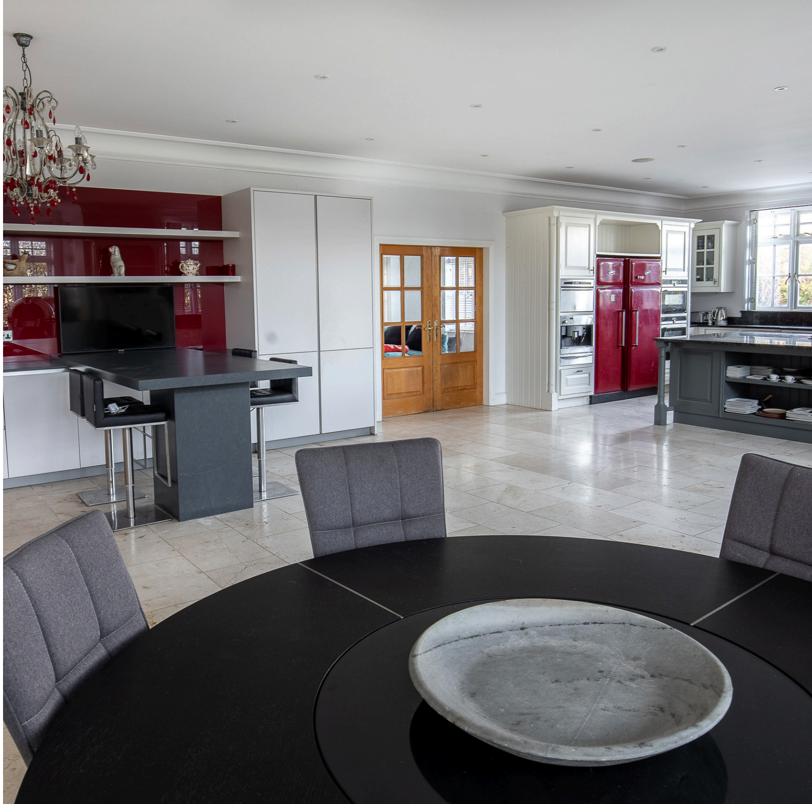
CHURCHFIELD LODGE, WINKFIELD