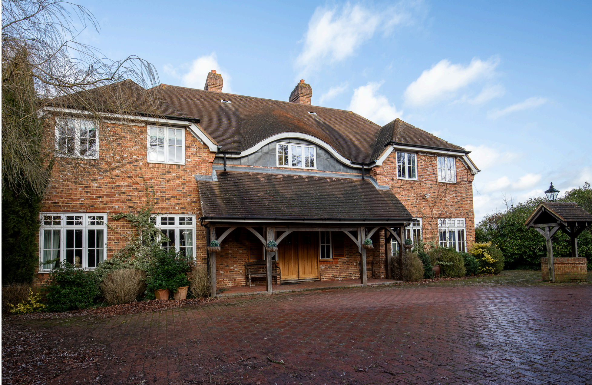
CHURCHFIELD LODGE, WINKFIELD