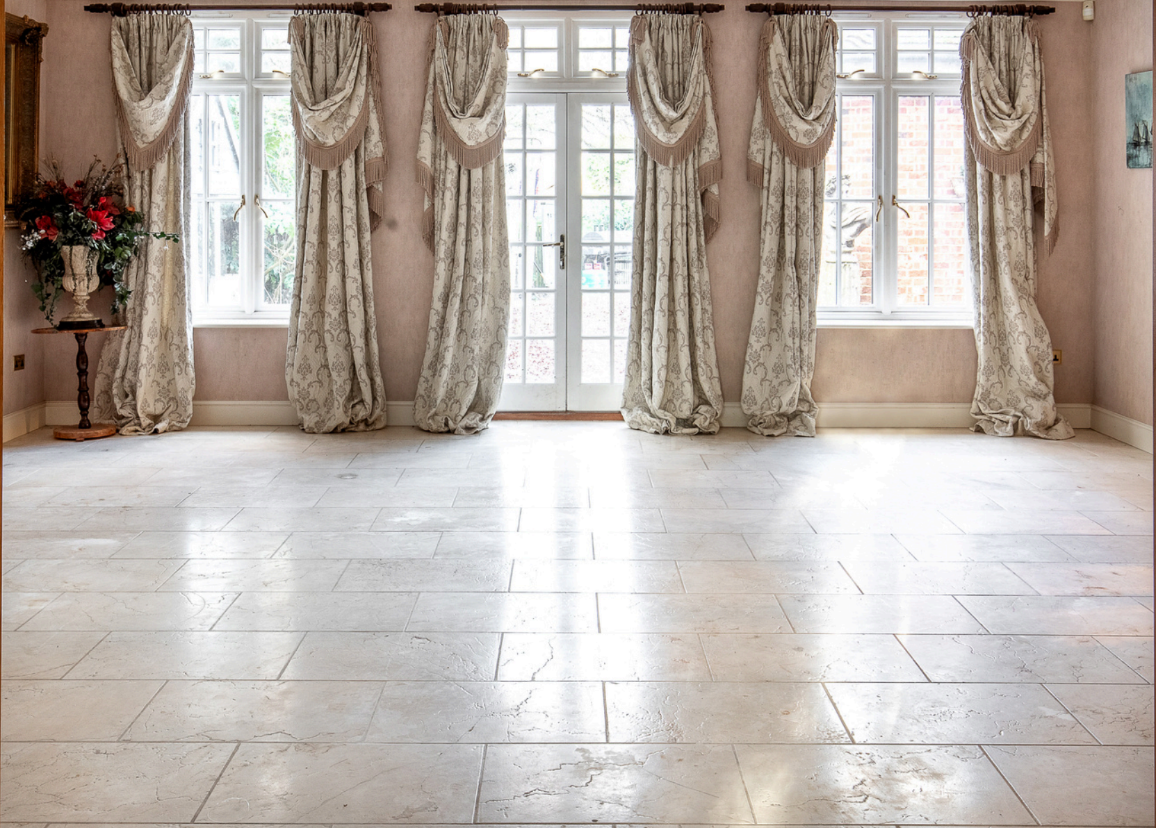
CHURCHFIELD LODGE, WINKFIELD