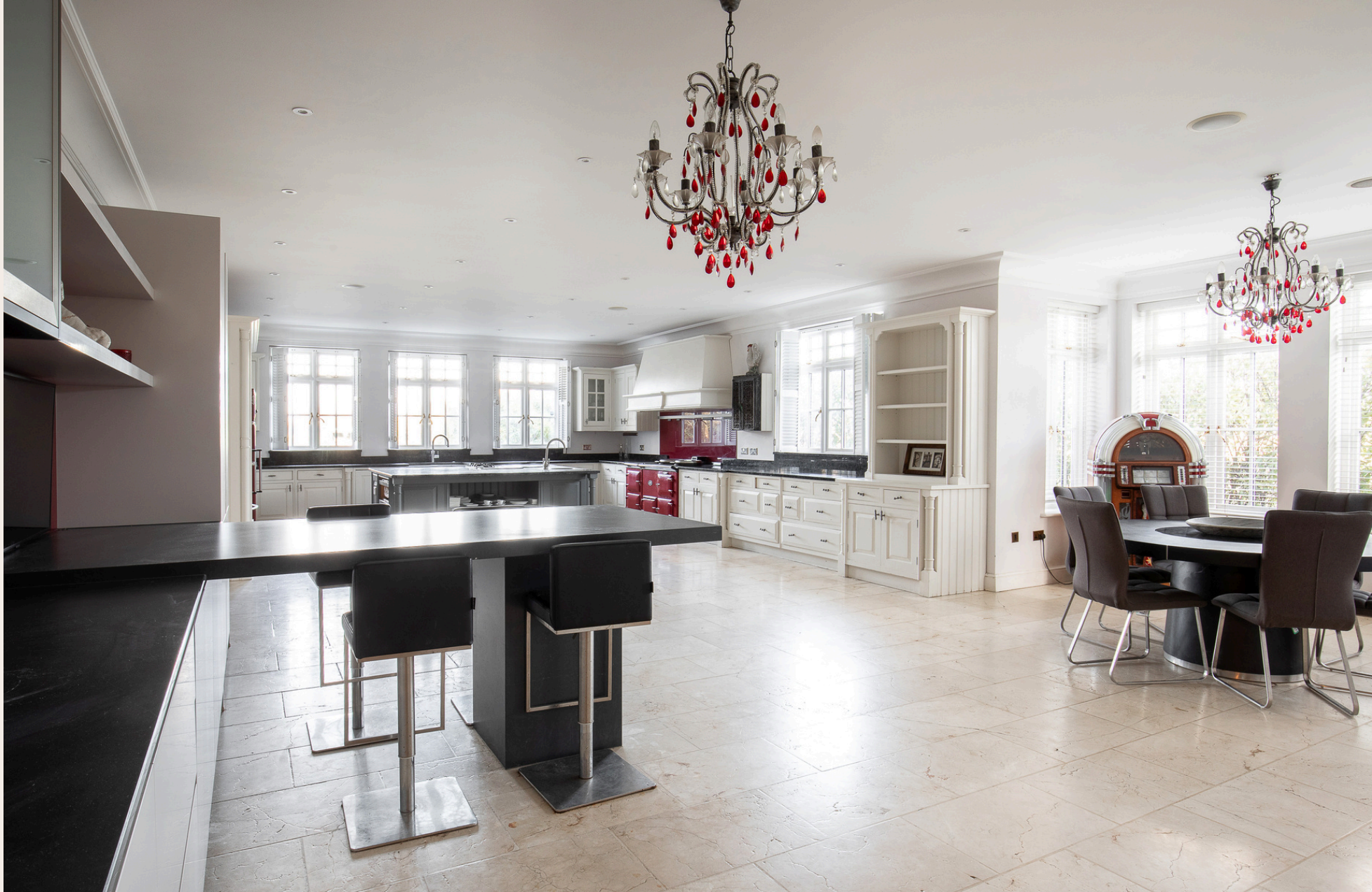
CHURCHFIELD LODGE, WINKFIELD