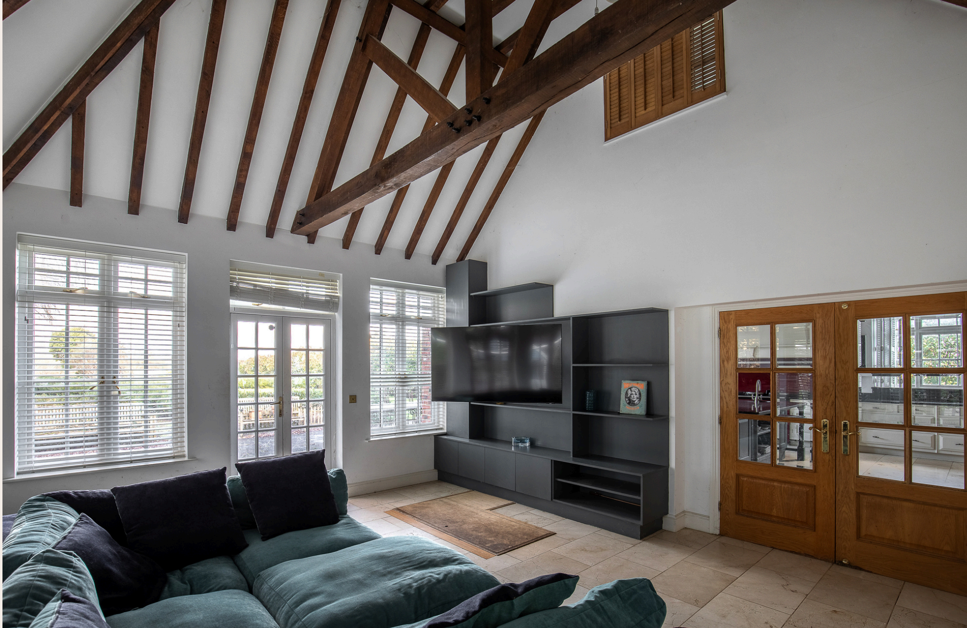
CHURCHFIELD LODGE, WINKFIELD