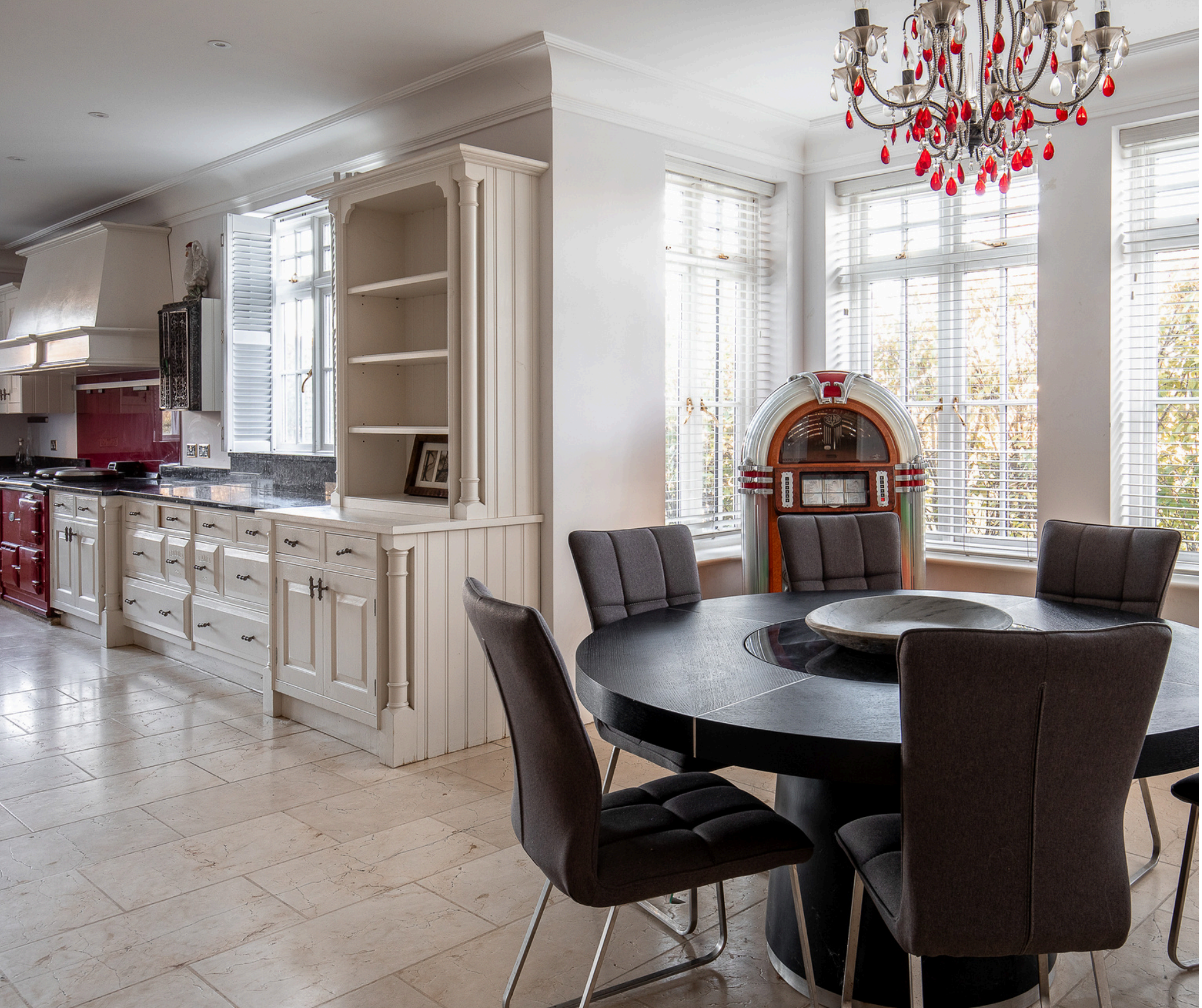
CHURCHFIELD LODGE, WINKFIELD