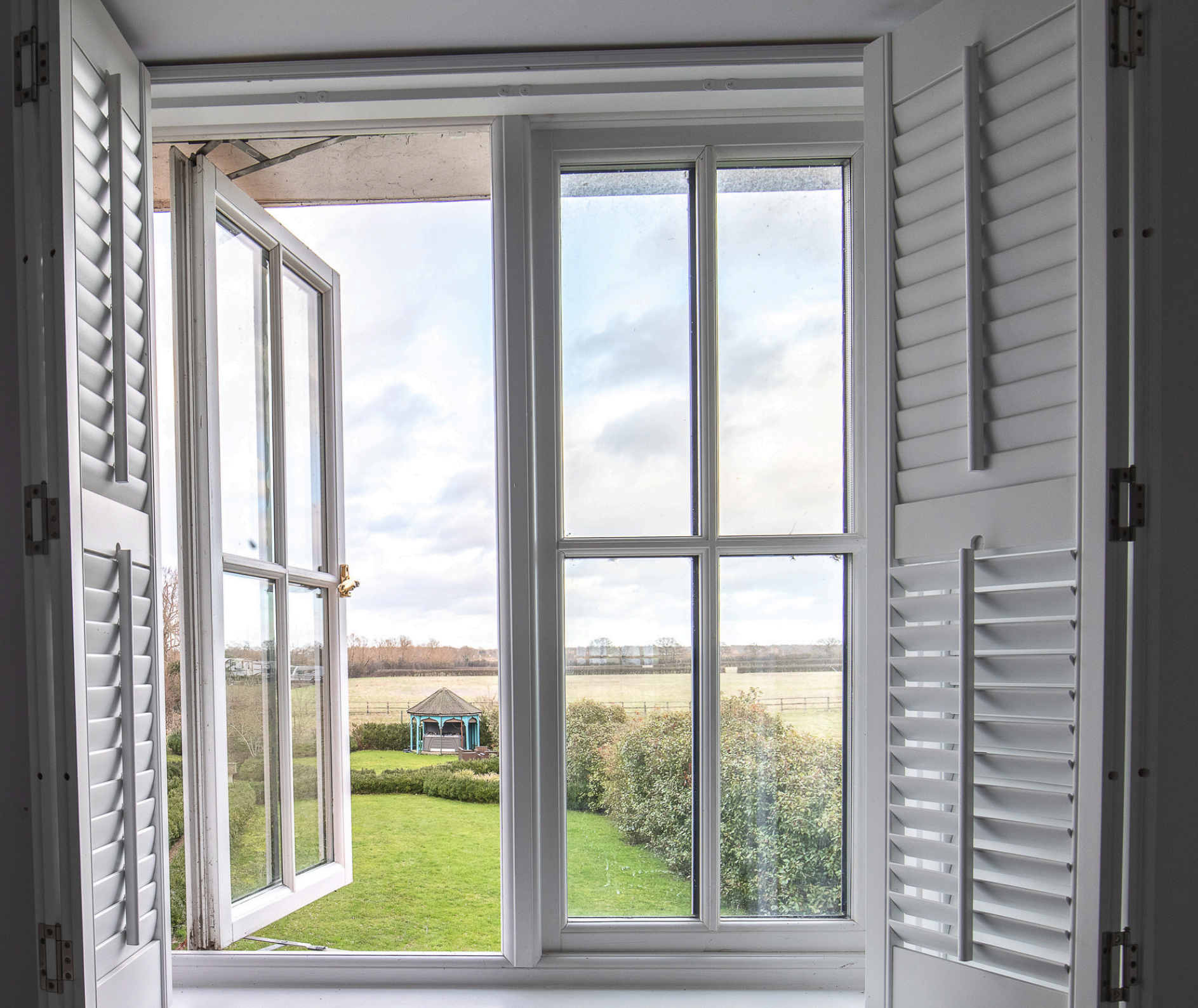
CHURCHFIELD LODGE, WINKFIELD