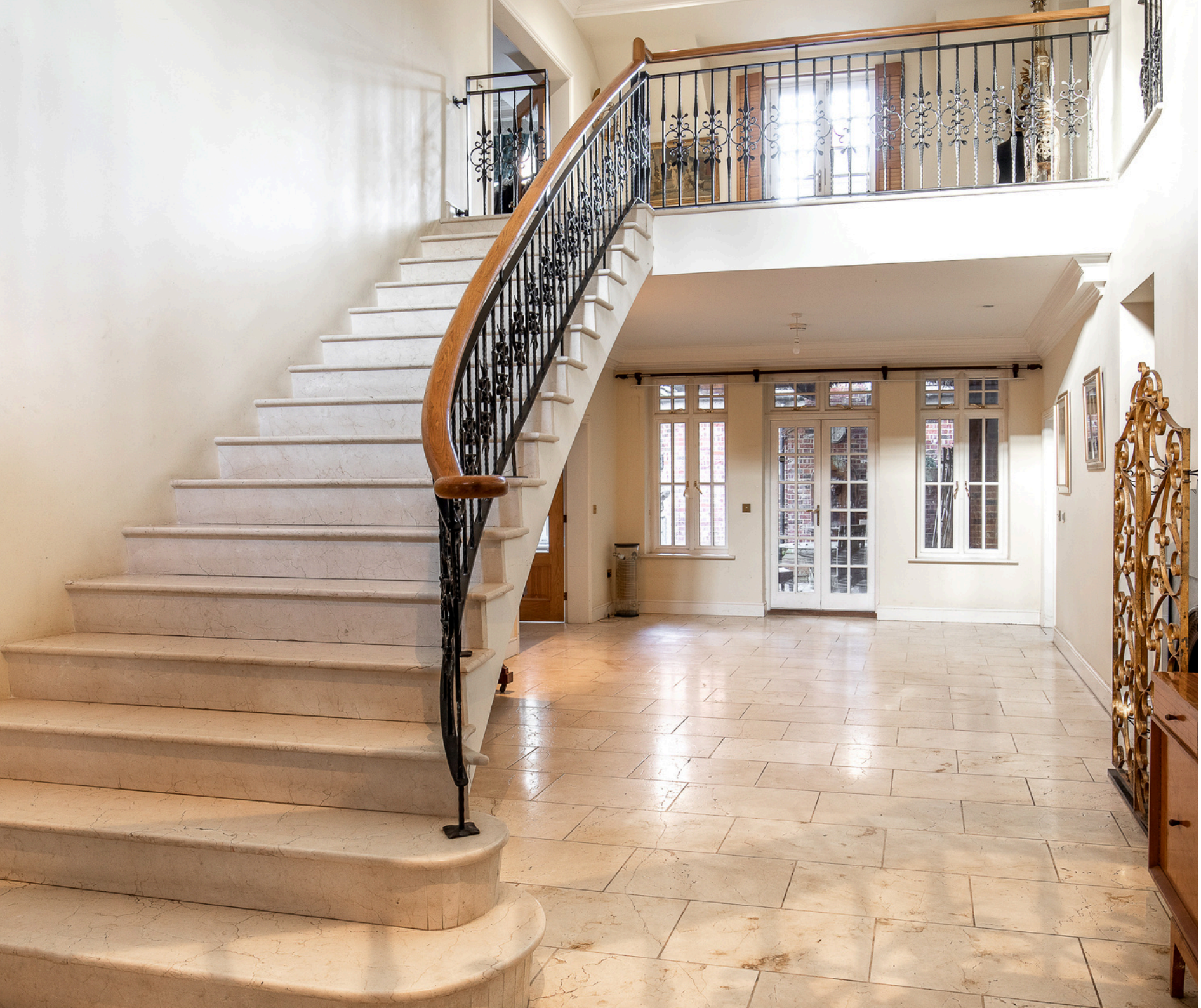
CHURCHFIELD LODGE, WINKFIELD