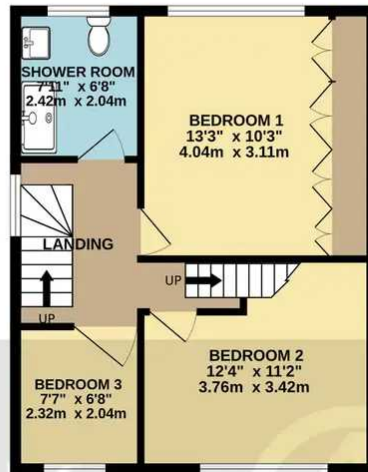
1ST FLOOR 466 sq.ft. (43.2 sq.m.) approx.