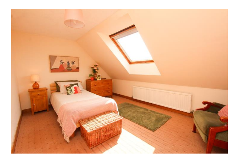
BEDROOM 5: A bedroom to the rear with CH radiator.

A bedroom to the front with a view to Loch Ryan. CH radiator.