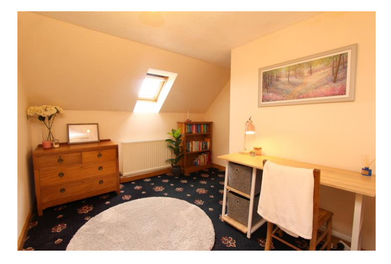
BOXROOM: A useful storage room located off the landing.