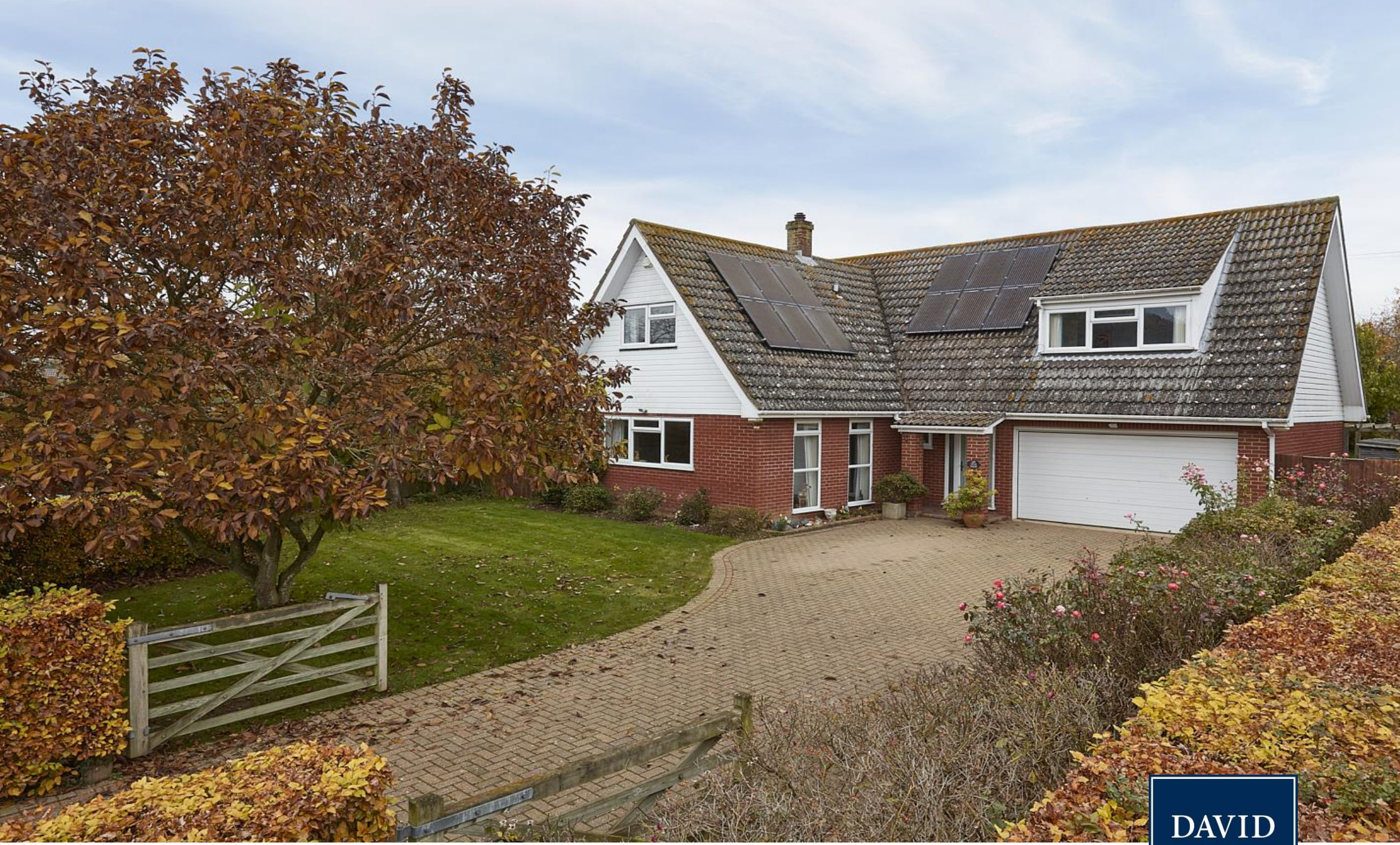
Jay House Hundon, Sudbury, Suffolk