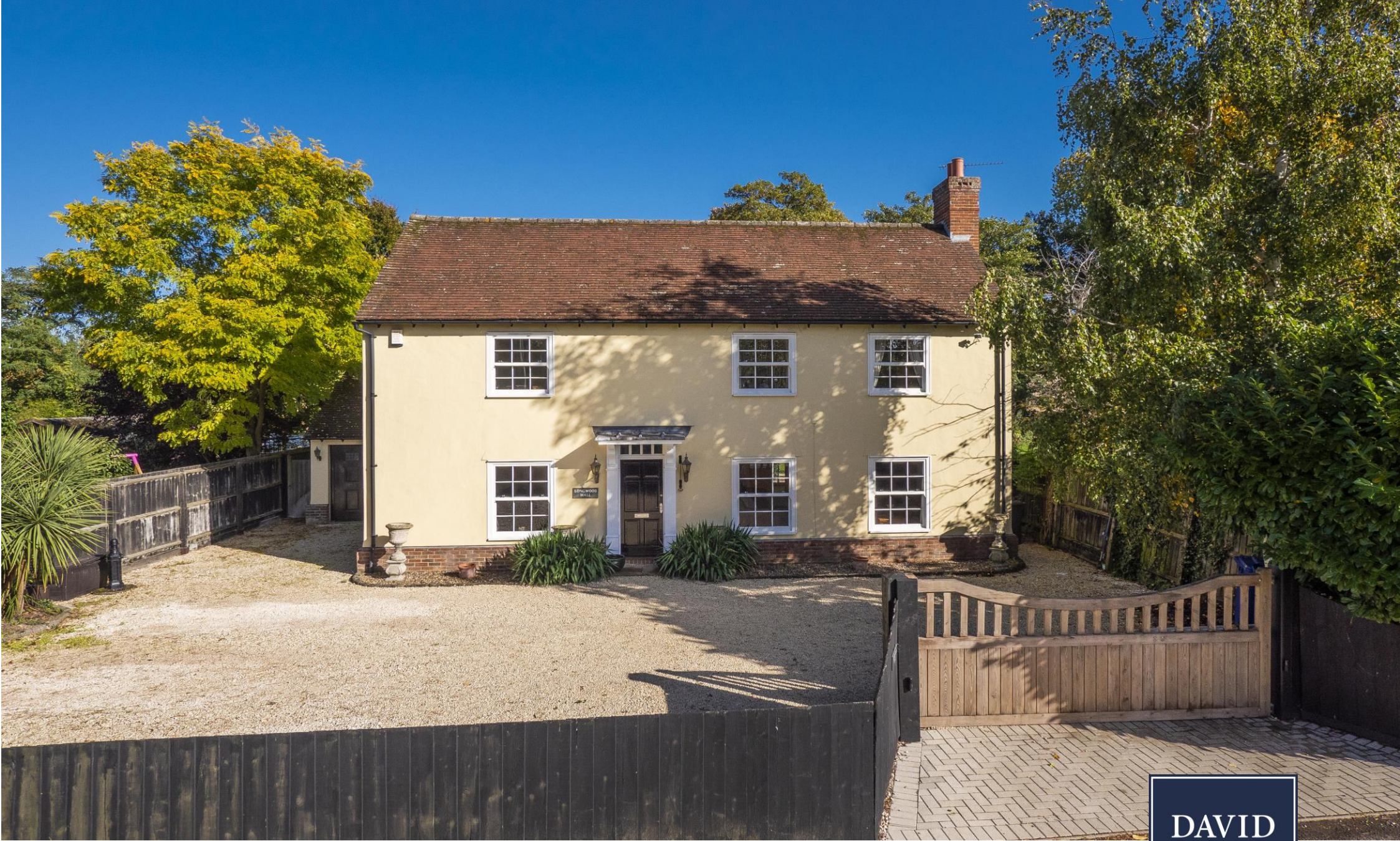
Longwood Hall Clare, Suffolk