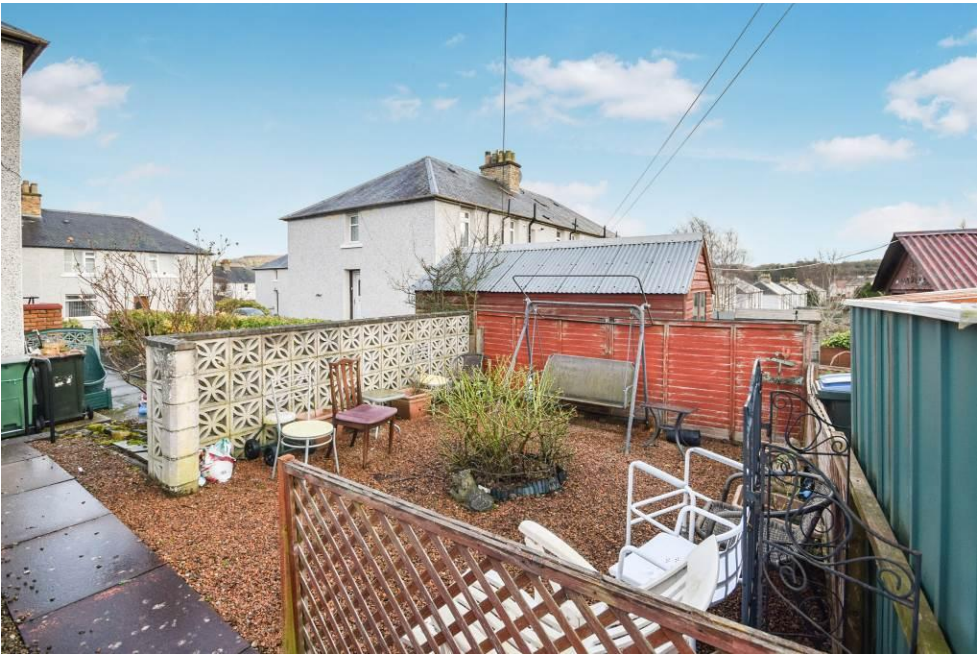
Next Home - 20B Murray Crescent, Perth, PH2 0HT