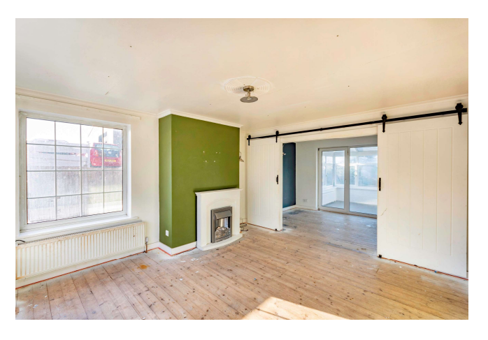
DINING ROOM 12'9" x 8'2" (3.94m x 2.50m) also accessible from the kitchen. Wall lights, double glazed window and door into

LOUNGE 13'6" x 12'9" (4.15m x 3.94m) double aspect to front and side with double glazed bow window, feature fireplace with pebble effect electric fire. TV point. Wall light points. Sliding doors to