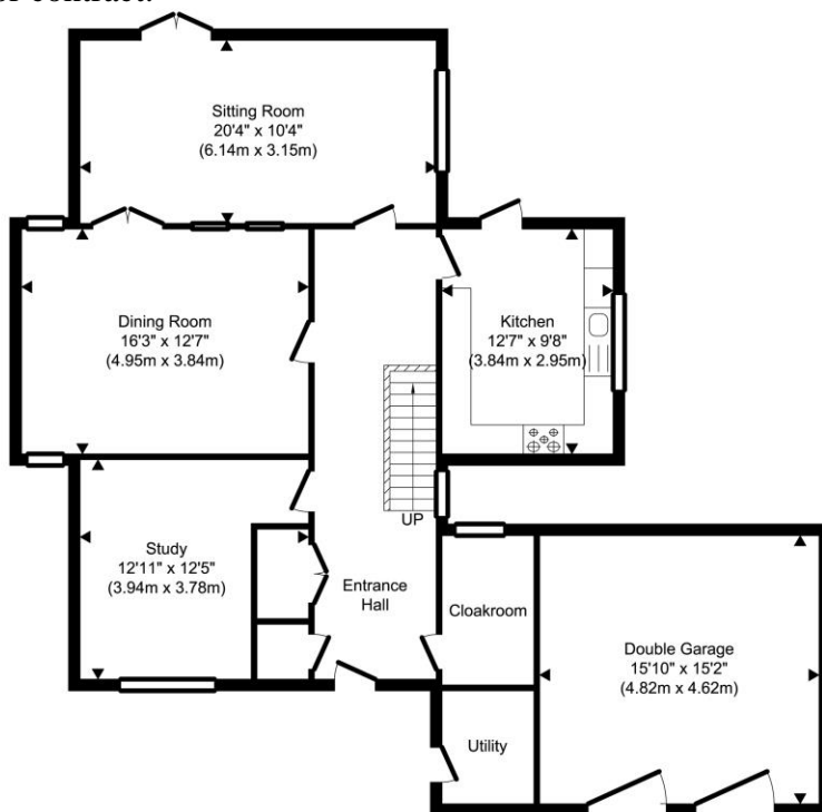
Ground Floor Approximate Floor Area 1218.58 sq. ft. (113.21 sq. m)

correctness. No representation or warranty whatsoever is made in relation to this property by David Burr or its employees nor do such sales details form part of any offer or contract.