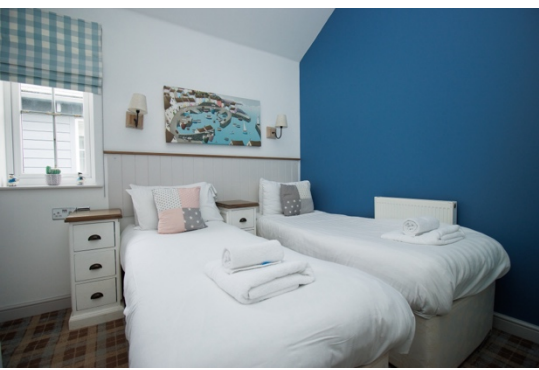
Built-in wardrobe. Radiator. Upvc double glazed window.