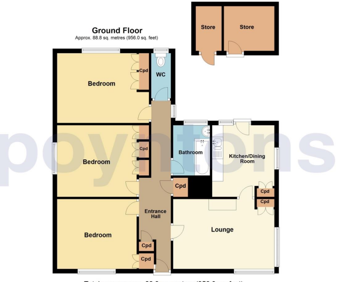
Total area: approx. 88.8 sq. metres (956.0 sq. feet)

All images used are for illustrative purposes. Images are for guidance only and may not necessarily represent a true and accurate depiction of the condition of property. Floor plans are intended to give an indication of the layout only. All images, floor plans and dimensions are not intended to form part any contract. Plan produced using PlanUp.