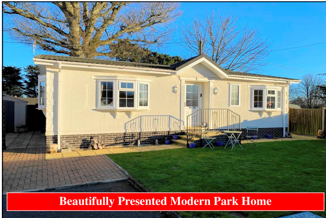
Beautifully Presented Modern Park Home

22 Slepe Park, Dorchester Road, Slepe, Poole, Dorset. BH16 6HT