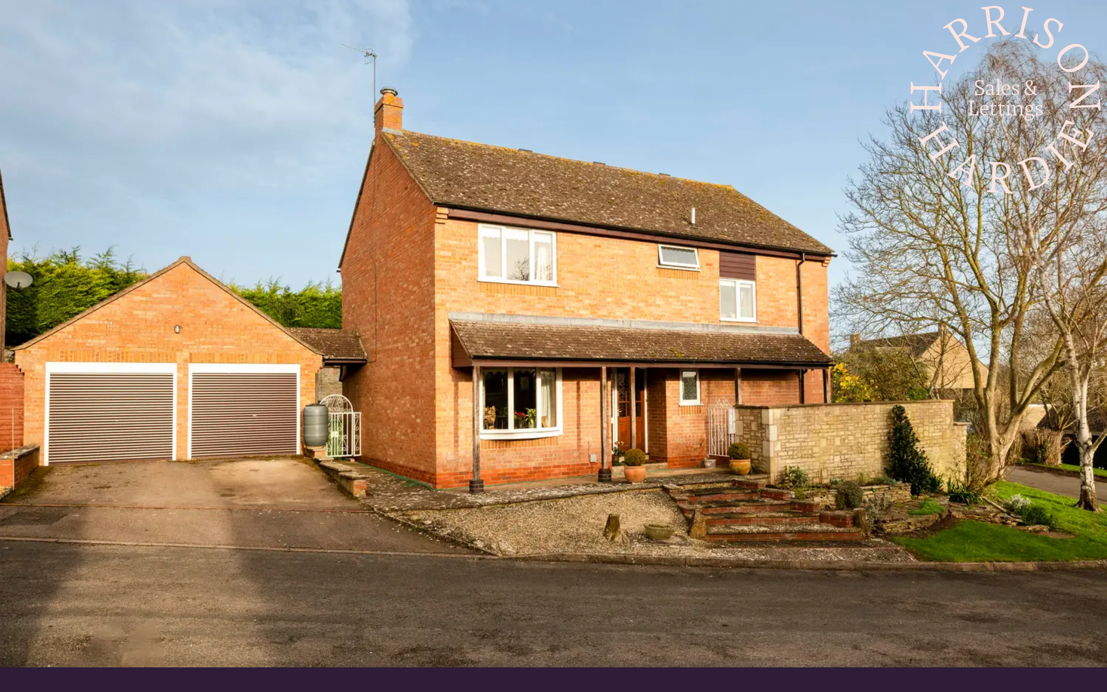
6 Park View Lane, Newbold On Stour