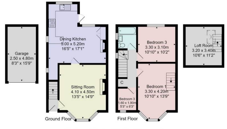
Total Area: 93.1 m²... 1002 ft² (excluding garage) All measurements are approximate and for display purposes only. No liability is accepted by either the agency or Box Property Solutions Ltd as to the exact measurements of the rooms. Box Property Solutions Ltd retains the copyright on this plan and allows agents to use it with agreed permission.