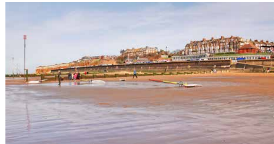
Hunstanton beach and seafront

“It's lovely to stroll along the seafront - and it's so close!”