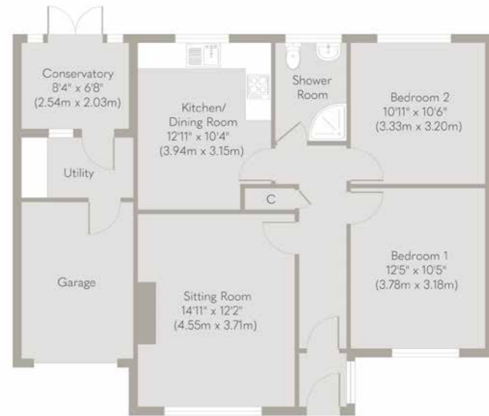
Approximate Floor Area 930 sq. ft (86.39 sq. m)

Whilst every attempt has been made to ensure the accuracy of the floor plan contained here, measurements of doors, windows, rooms and any other items are approximate and no responsibility is taken for any error, omission, or mis-statement. This plan is for illustrative purposes only and should be used as such by any prospective purchaser or tenant. The services, systems and appliances shown have not been tested and no guarantee as to their operability or efficiency can be given.