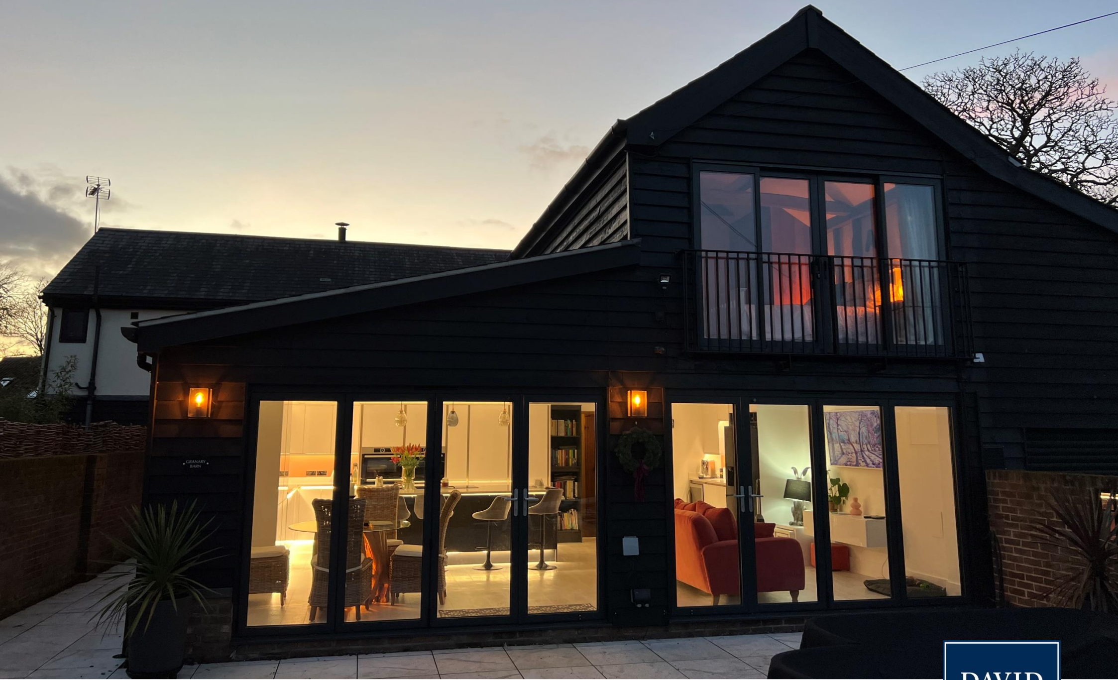
Granary Barn, Mill Lane Creting St Peter, Suffolk