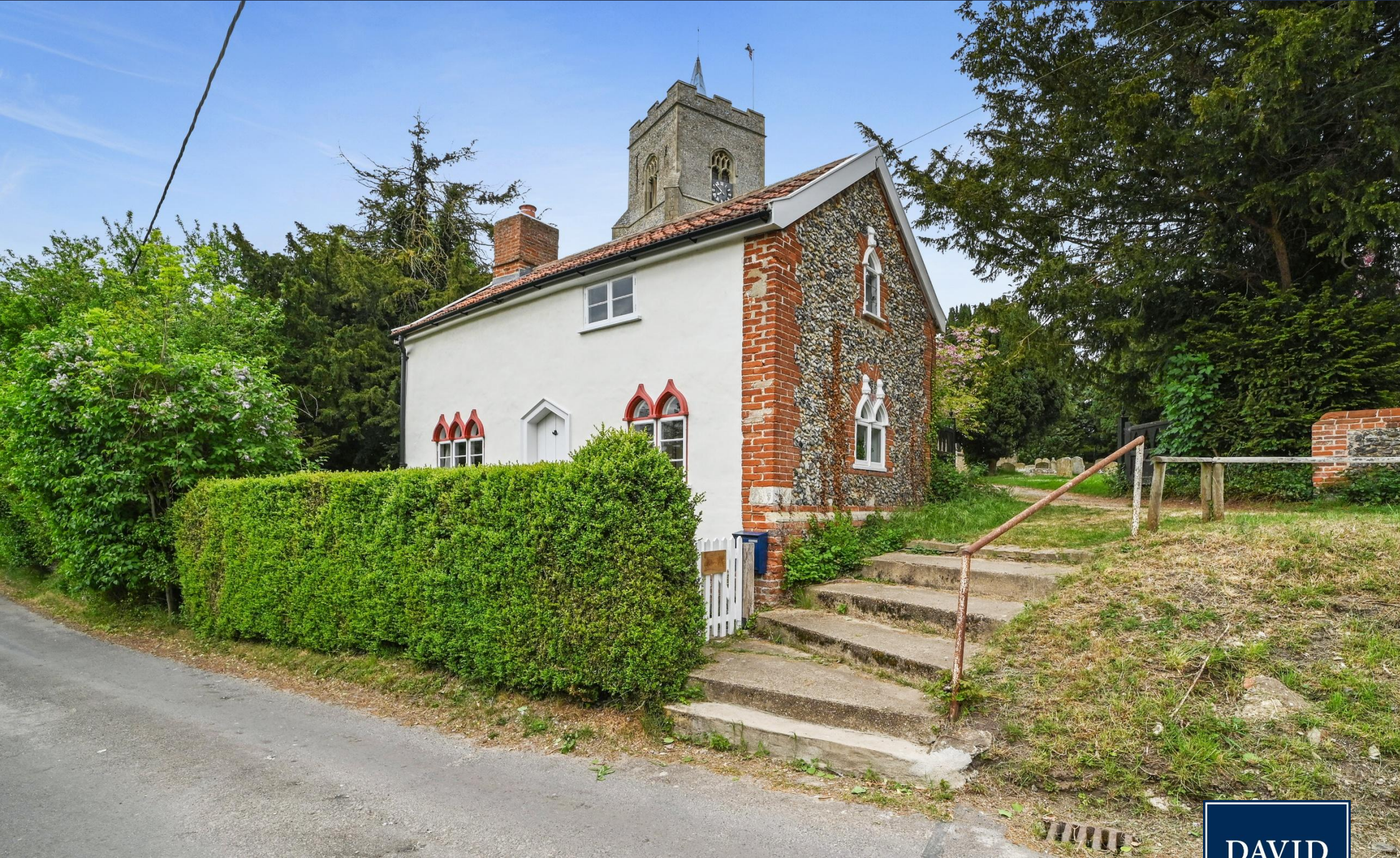
Bell Cottage Bardwell, Suffolk