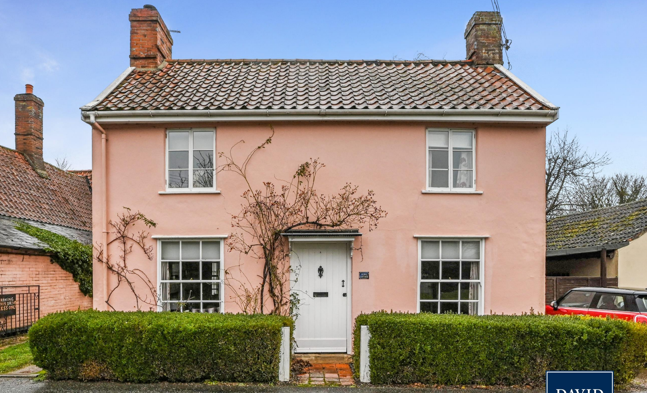
Alma Cottage Felsham, Suffolk