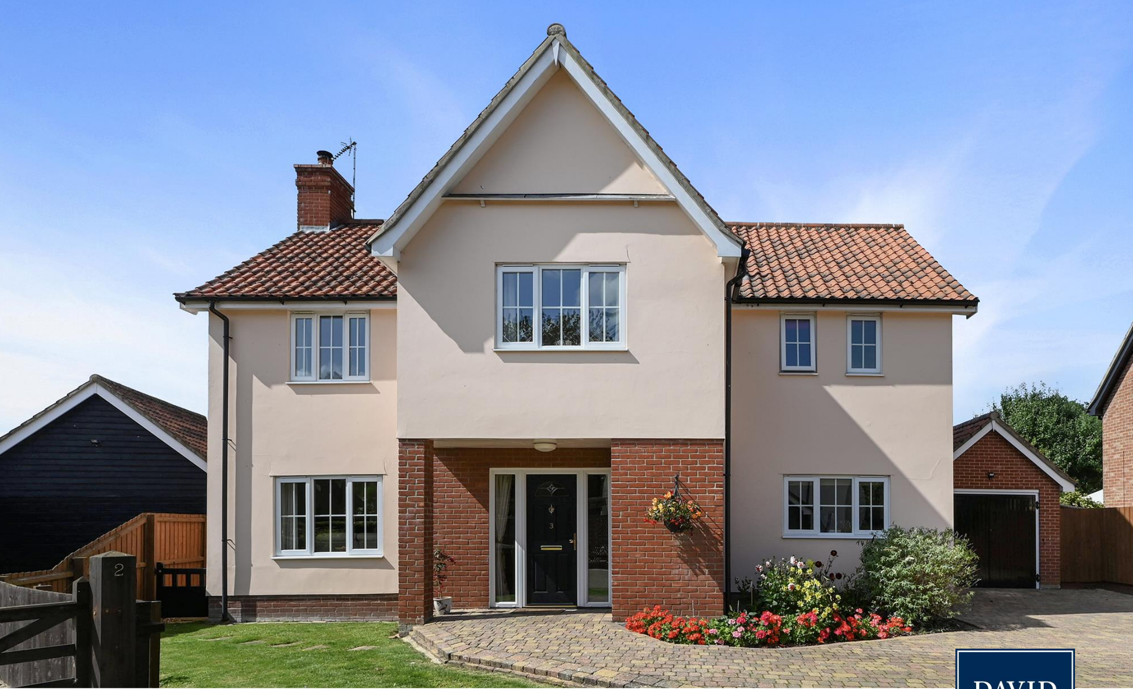
Brandon House, 3 Tudor Court Westhorpe, Suffolk