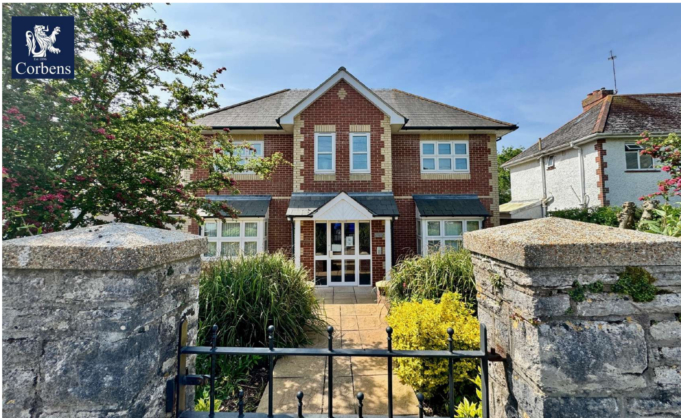
2 BEACH HAVEN, RABLING ROAD, SWANAGE £265,000 Leasehold