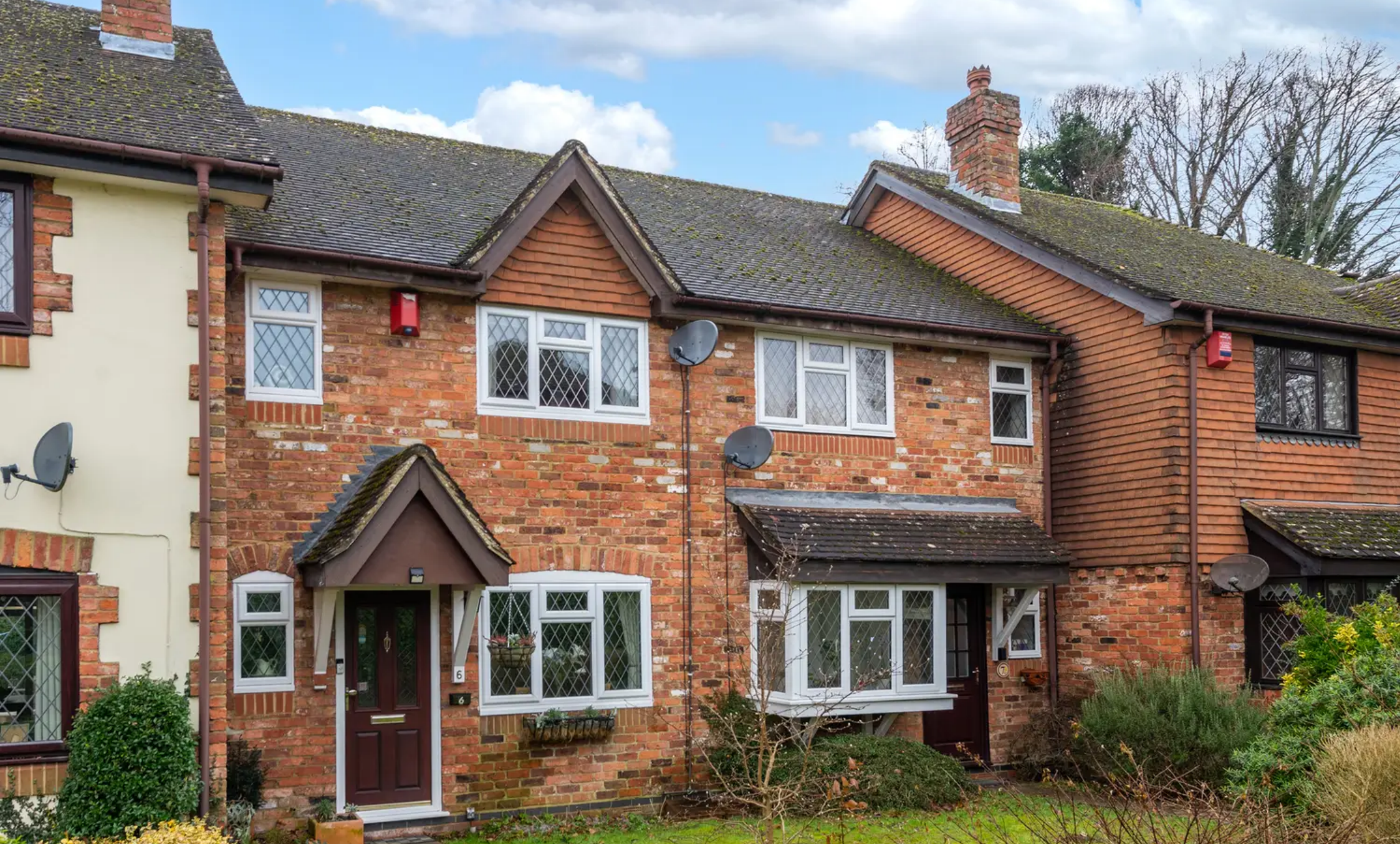
6 Shortacres, Nutfield