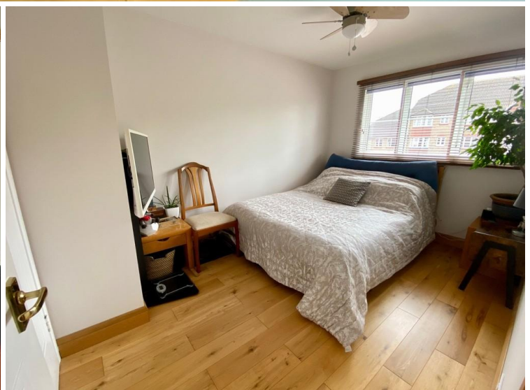
52 Caraway Place, Wallington, Surrey, SM6 7AG | Guide Price £284,000 Leasehold

Situated in a popular residential development close to Beddington Park and Hackbridge station, this well presented first floor apartment boasts a 19'11 lounge/diner, modern fitted kitchen, two bedrooms and a refitted bathroom. The property also has an allocated parking space and secure residents bike storage.