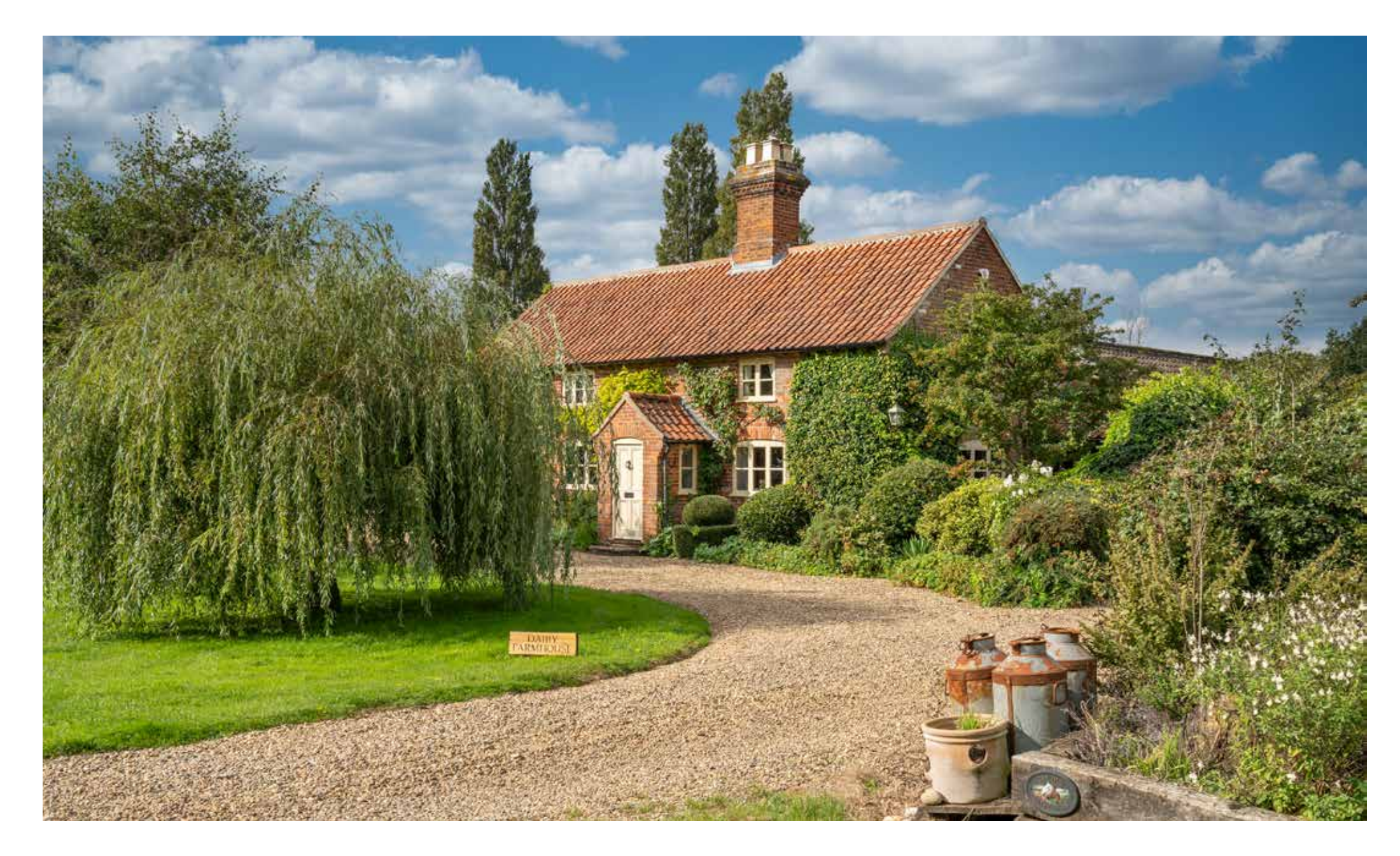
Dairy Farmhouse Norwich Road | Mulbarton | Norfolk | NR148JN