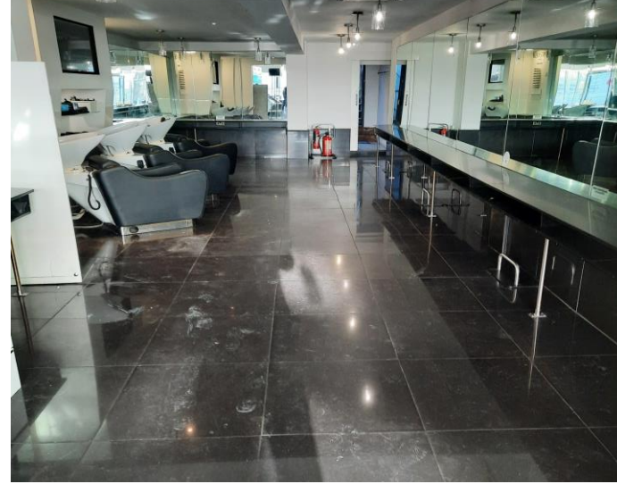
First floor salon