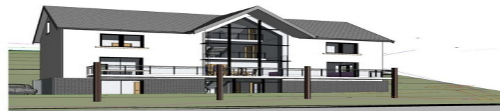
9 3D View 2