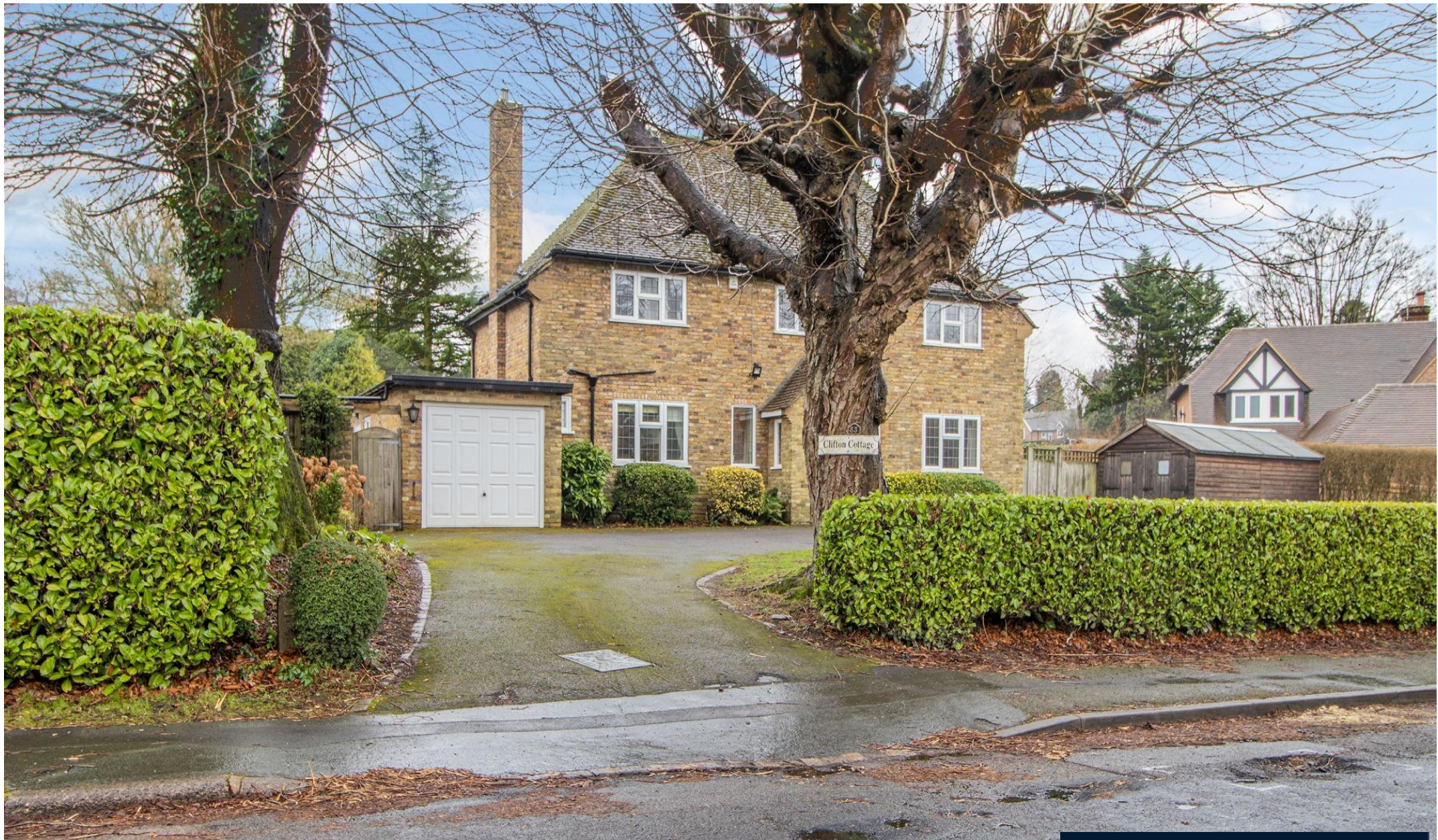
Clifton Cottage, 53 Clifton Road, Chesham Bois, Buckinghamshire, HP6 5PN