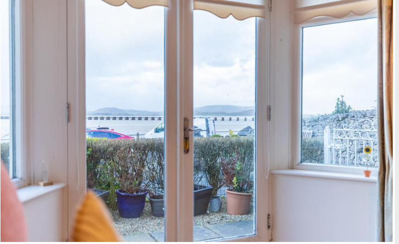
Stunning Kent Estuary Views