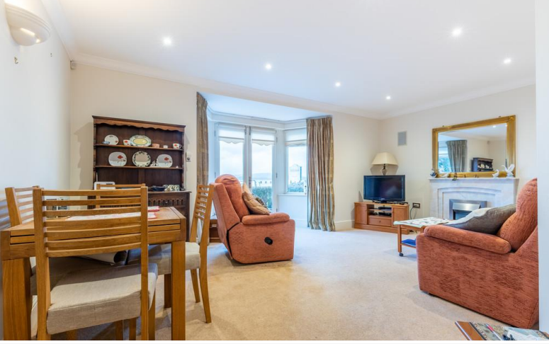
Living Dining Room