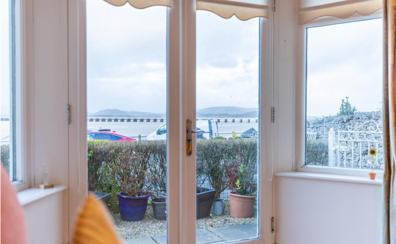
Stunning Kent Estuary Views