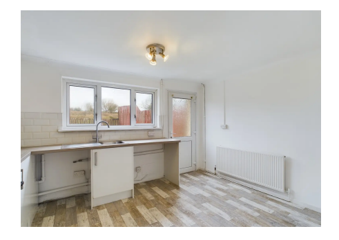
Council Tax band: A Tenure: Freehold Energy Efficiency Rating: C