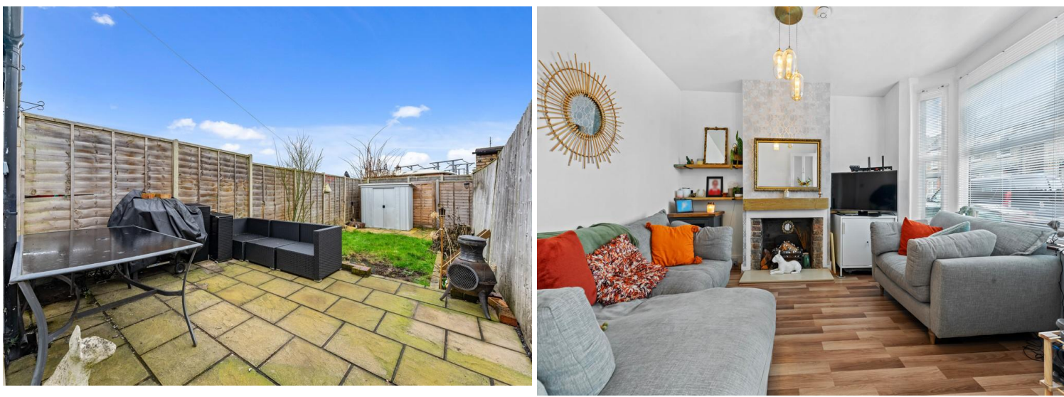
49 Richmond Road, Beddington, Surrey, CR0 4SQ | £435,000 Freehold

Paul Graham are pleased to presented this attractive period house, which is conveniently located within easy reach of Beddington Park, excellent primary schools, bus routes and Beddington Cross tram stop. The property offers a well maintained interior comprised of a lounge, open plan kitchen/dining room and modern bathroom. Upstairs there are three good size bedrooms. Outside, there is a low maintenance garden.