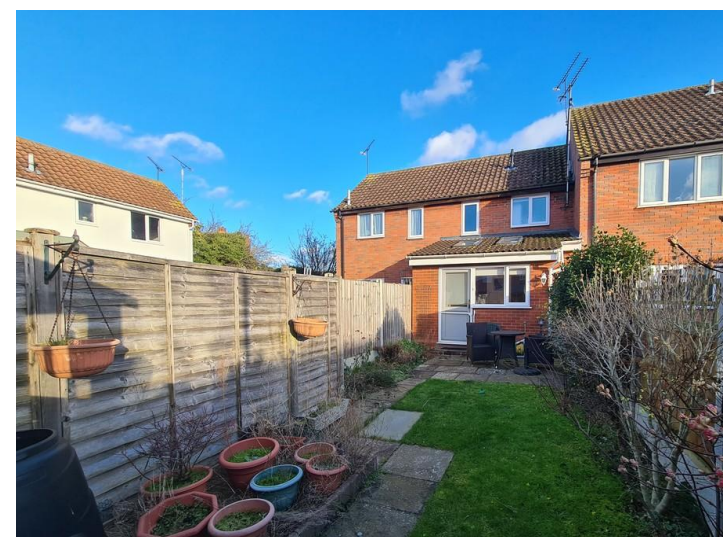
To view this property call Curtis O' Boyle Estate Agents on 01621\ 855558