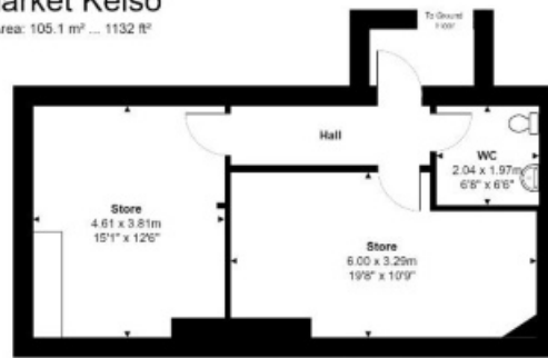
Lower Ground Floor Approximate Area: 48.3 m 2 ... 519 ft 2

Whilst every attempt has been made to ensure the accuracy of the floor plan contained here, measurements of doors, windows, rooms and any other items are approximate and no responsibility is taken for any error, omission or mis-statement. This plan is for illustrative purposes only and should be used as such by any prospective purchaser or tenant. The services, systems and appliances shown have not been tested and no guarantee as to their operability or efficiency can be given.