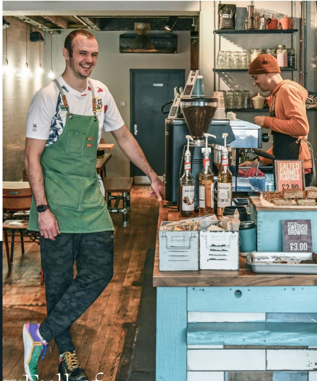
Manny Dartin Cafe