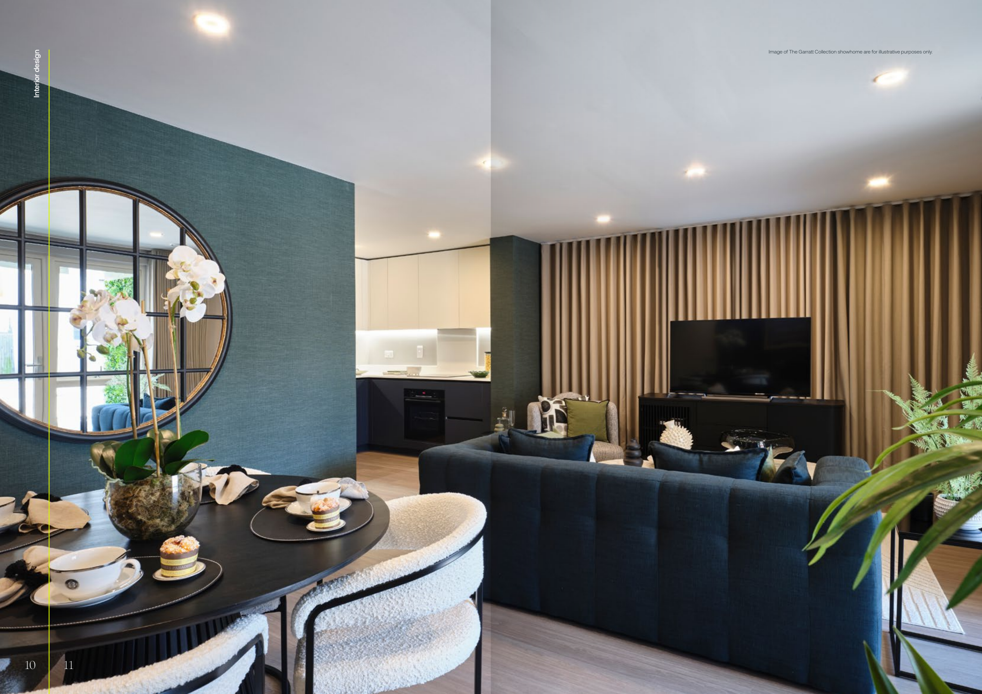
Image of The Garratt Collection showhome are for illustrative purposes only.