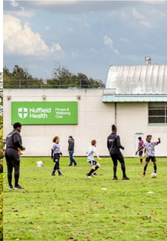
Nuffield Health Wandsworth