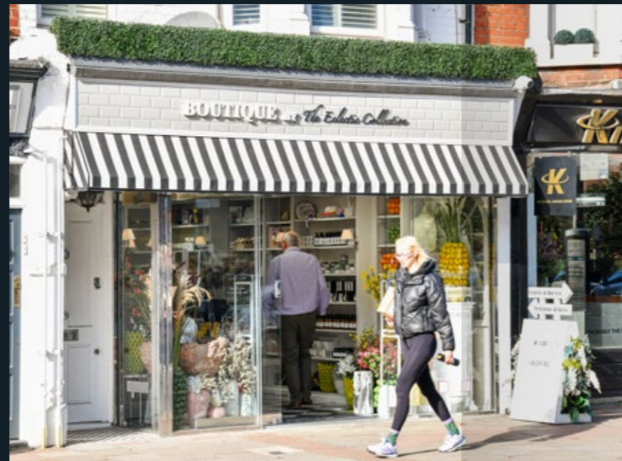
Boutique by The Eclectic Collection

Independents... the beating heart of Earlsfield