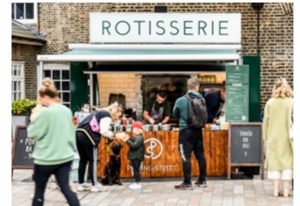
Rotisserie / Bellwether Lane

A close-by favourite for parents is Tribe Time, with its soft play, proper coffee, fresh salads and indulgent pastries – a must on a rainy day with wriggly under-5s.