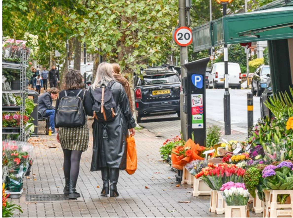
Wimbledon Farmer's Market