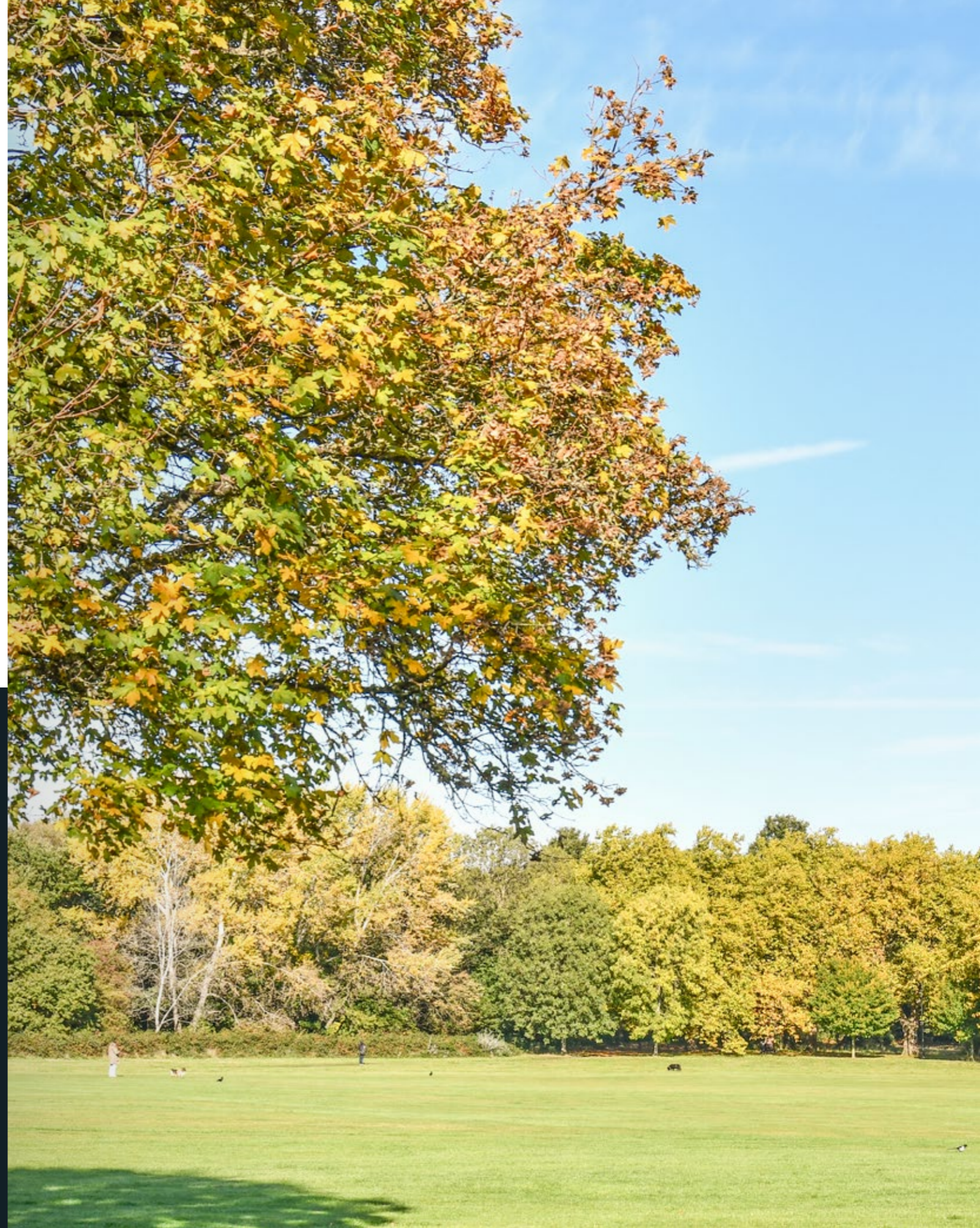
King George's Park

Fitness enthusiasts will love the choice of gyms in and around the borough, from major names like Nuffield Health and Virgin Active to privately owned studios and active spaces such as MoreYoga and The Font – a world-class bouldering centre built for the urban climbing community.