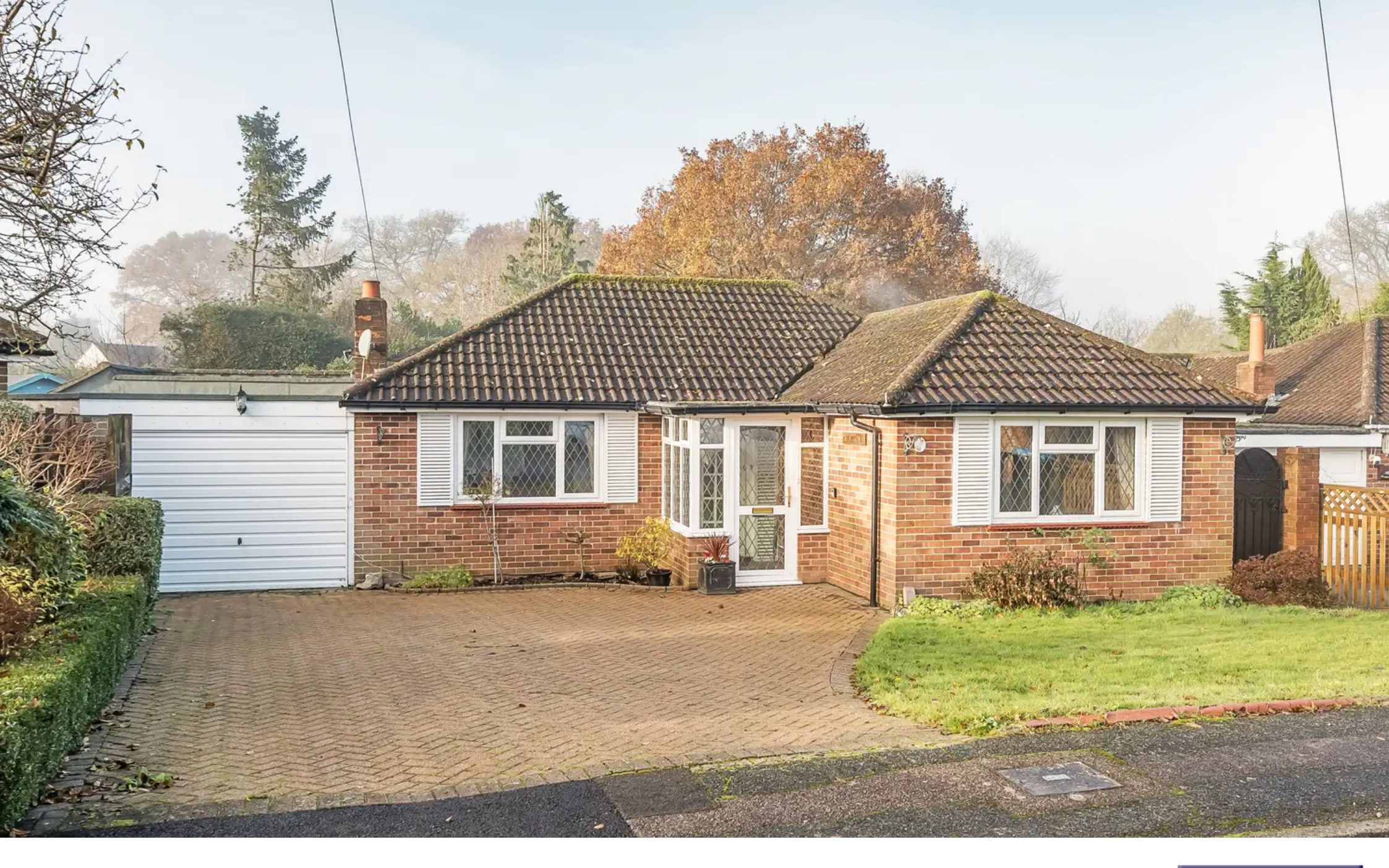
3 Parsonage Close, Warlingham - CR6 9EN Guide Price £650,000