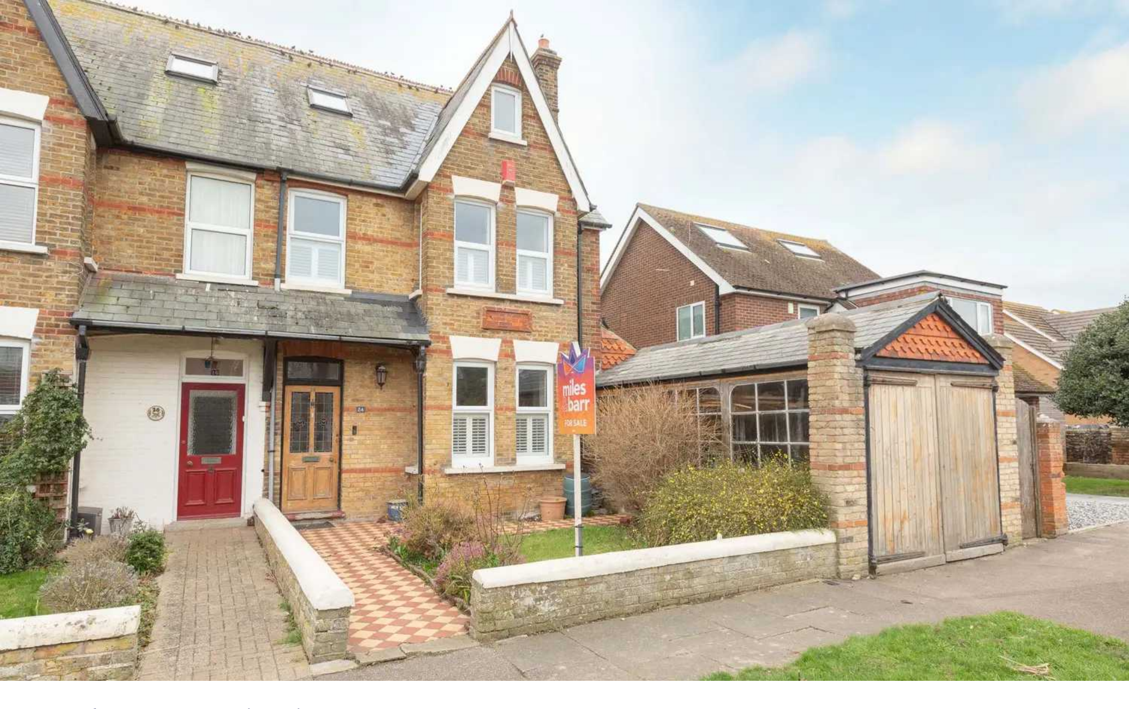
24 Alfred Road, Birchington £595,000