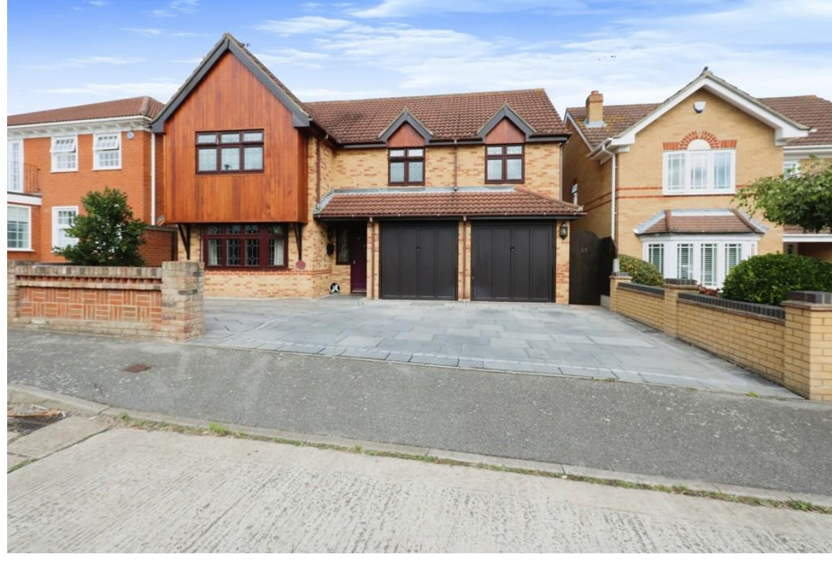
29 Hackamore, Benfleet, SS7 3DU Guide Price £800,000 - £900,000