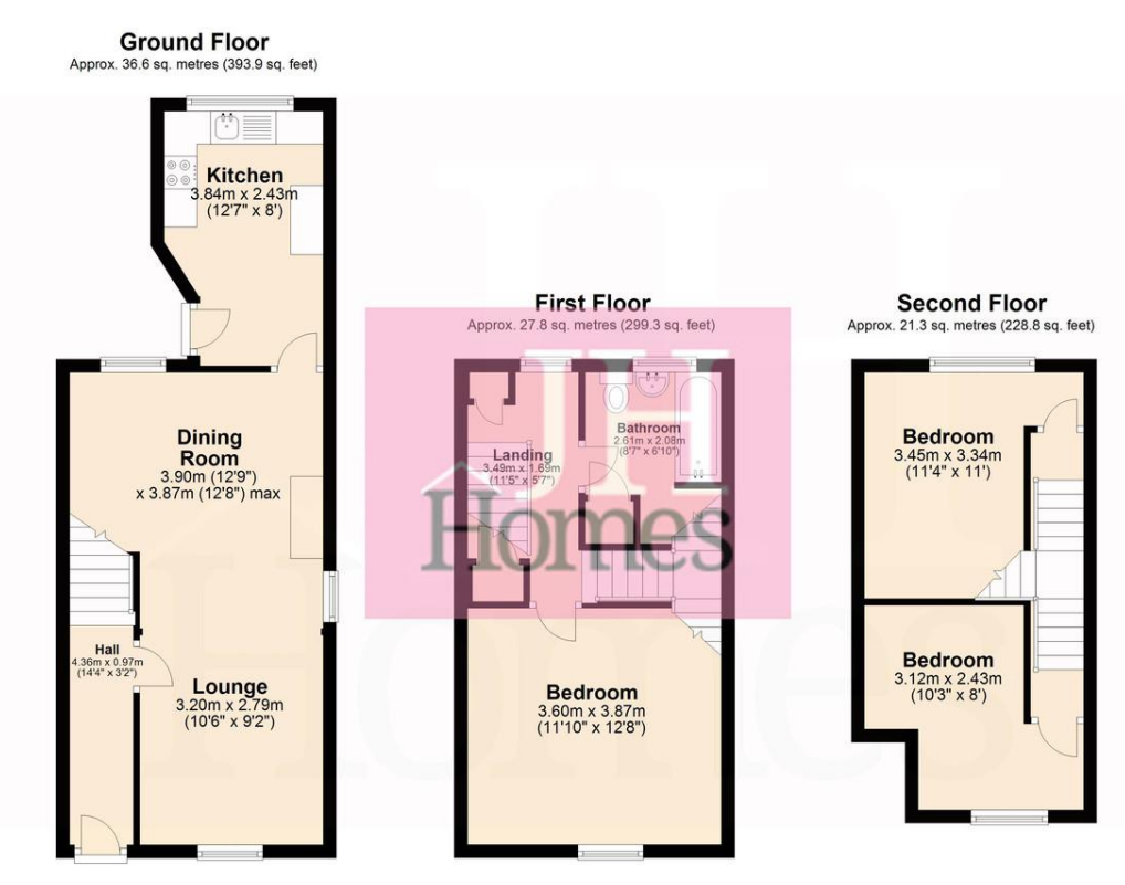
Total area: approx. 85.7 sq. metres (922.0 sq. feet)