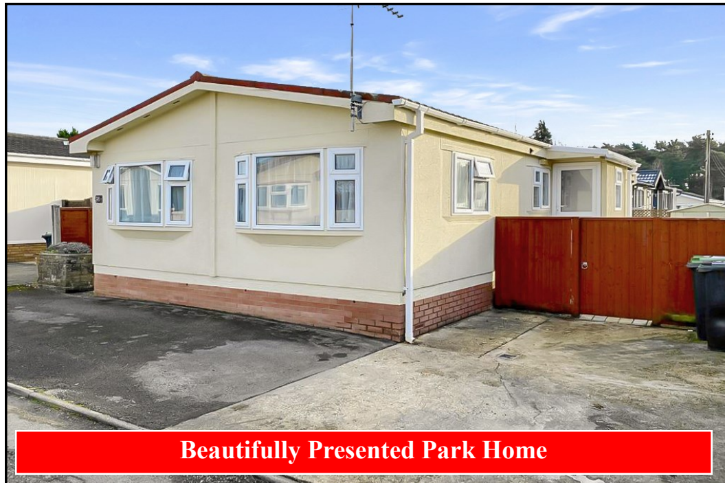
Beautifully Presented Park Home

98 Pinehurst Park, West Moors, Dorset. BH22 0BW