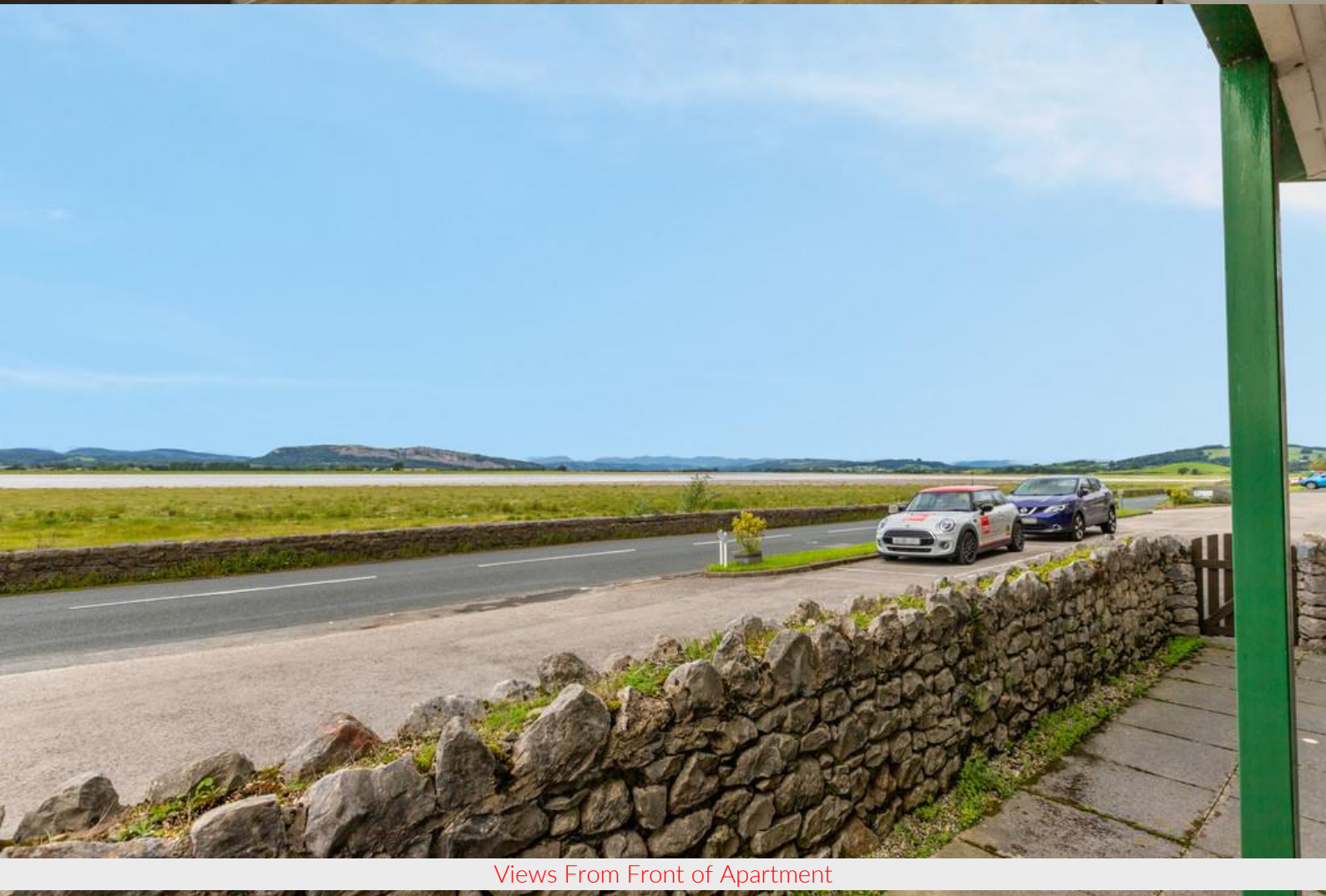
Views From Front of Apartment