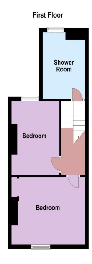
Copyright Oakwood homes - Not to be reproduced or copied without permission. All rights reserved. Plan produced using PlanUp.