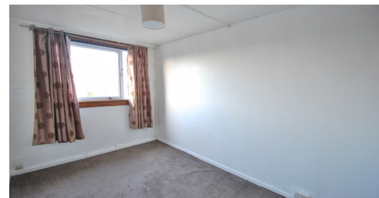
87 Brisbane Street Livingston