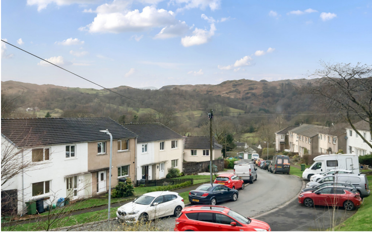
View from Property