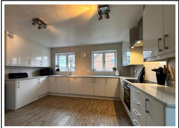
9 Sunningdale Close, Winsford, Cheshire, CW7 2LD £395,000

If your looking for a generously proportioned detached home, ideal for a family AND situated on the sought after development, The Fairways, look no further. This lovely double fronted detached home has a superb lay out with an inviting entrance hall, dining room, study, breakfast kitchen, guest w/c, a rear aspect lounge leading to the Conservatory which really compliments the ground floor. Whilst upstairs are four bedrooms, an en-suite to the main bedroom, jack and jill en-suite to bedrooms two and three, bedroom four and a family bathroom completes the accommodation. Meanwhile, externally this property is even more appealing being positioned on a prominent position, with an attractive rear garden, ample off-road parking and a double garage, what more could you possibly ask for? Don't delay and book your viewing today as this ideal family home will no doubt be very popular!!