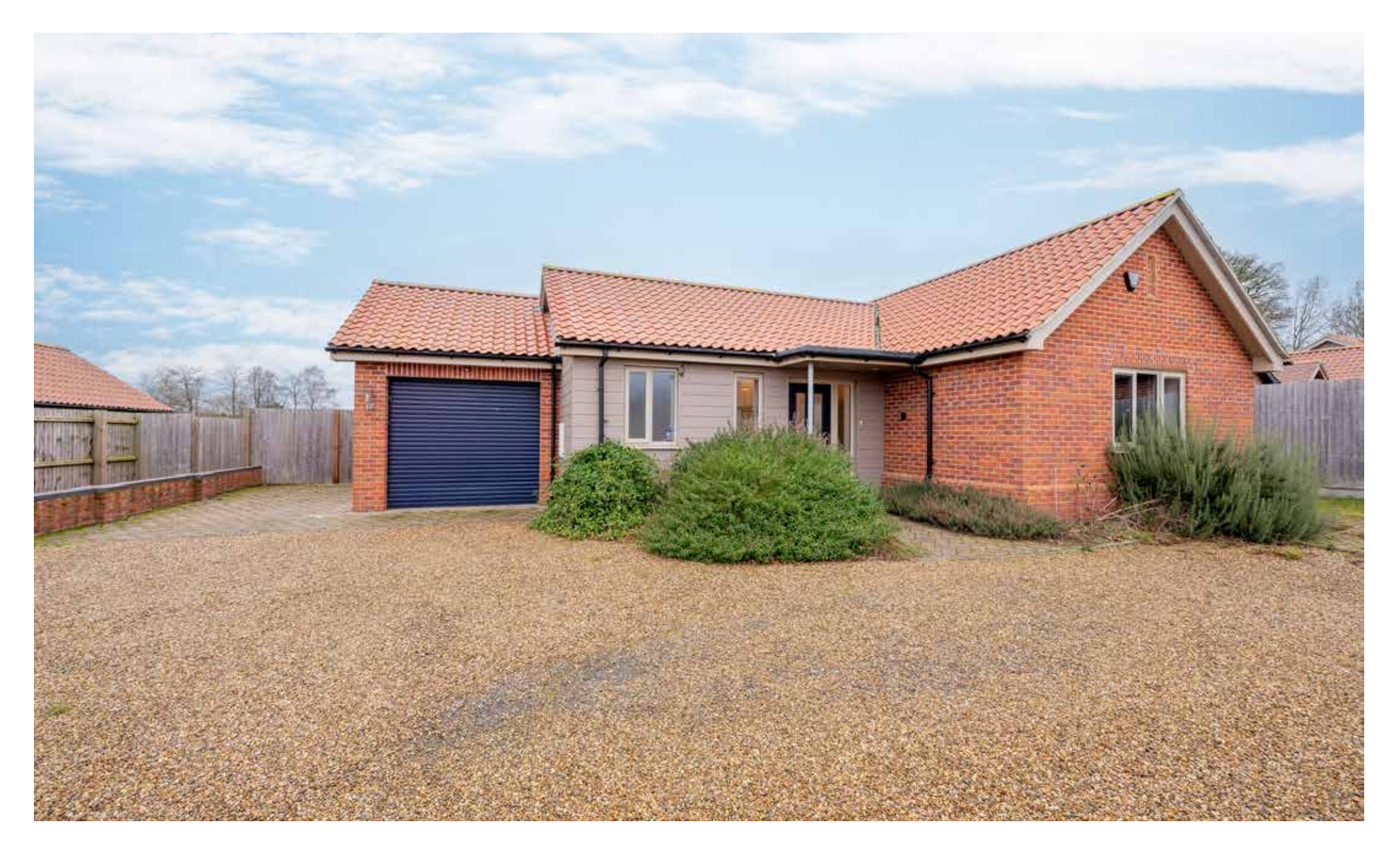
3 The Glade Guist | Norfolk | NR20 5AQ