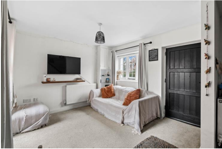
Lounge/Dining Room 17'7 x 10'2 (5.35 x 3.11m)