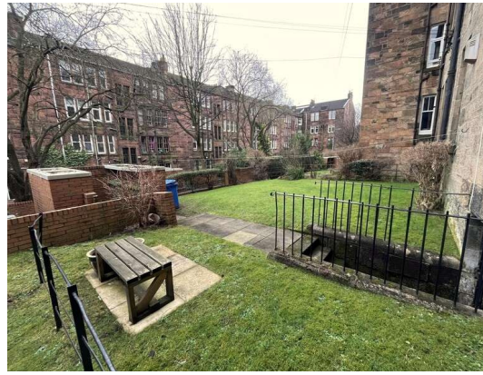
Ground Floor Flat 0/1 46 Polwarth Street, Hyndland, G12 9TJ Offers Over £285,000