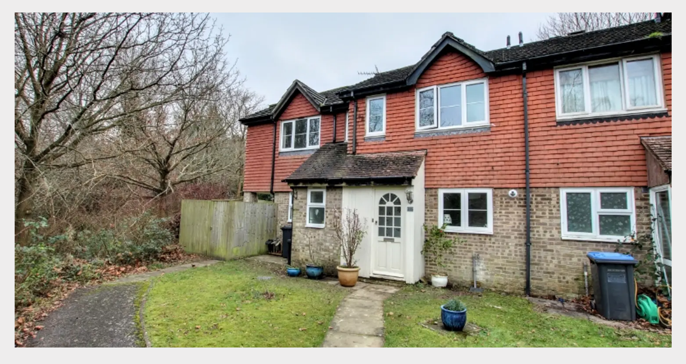
11 Albert Close, Haywards Heath, West Sussex RH16 3NW

GUIDE PRICE ... £500,000-£525,000 ... FREEHOLD