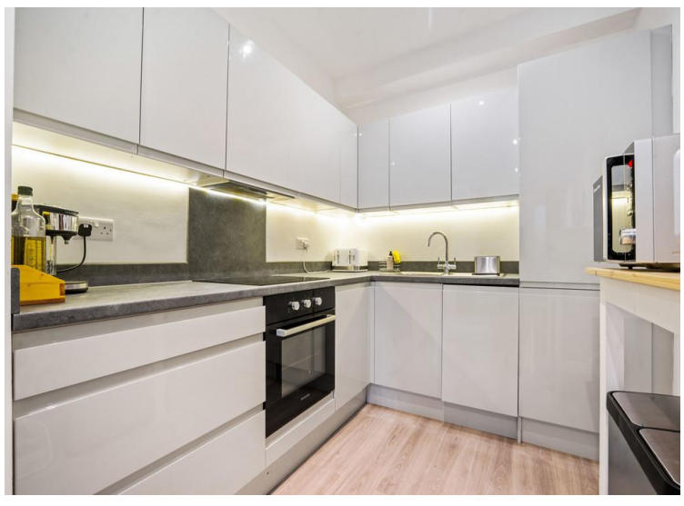
Flat 61 Marlborough Court, Cranley Gardens, Wallington, Surrey, SM6 9PG | £310,000 Leasehold

Paul Graham are pleased to market this modern 2 double bedroom ground floor purpose built flat. Features include a 14'8 reception room with dining/study area, 14'9 master bedroom with an en-suite shower room, 14'8 2nd bedroom, modern family bathroom and allocated parking. Situated on South Wallington close to Wallington Town Centre. Viewing recommended.