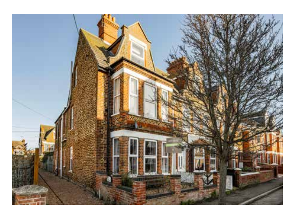
"A home well-located for the best of Hunstanton." SOWERBYS